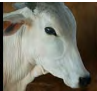
at two-years old