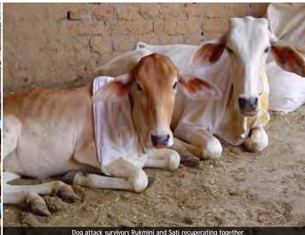
Dog attack survivors Rukmini and Sati recuperating together