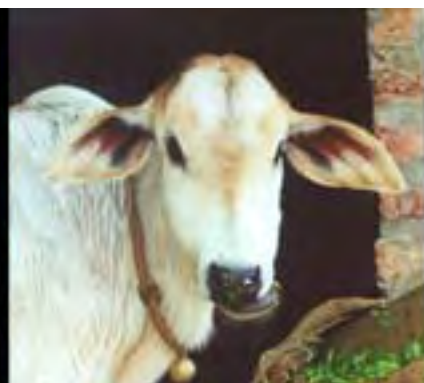
at three-months old