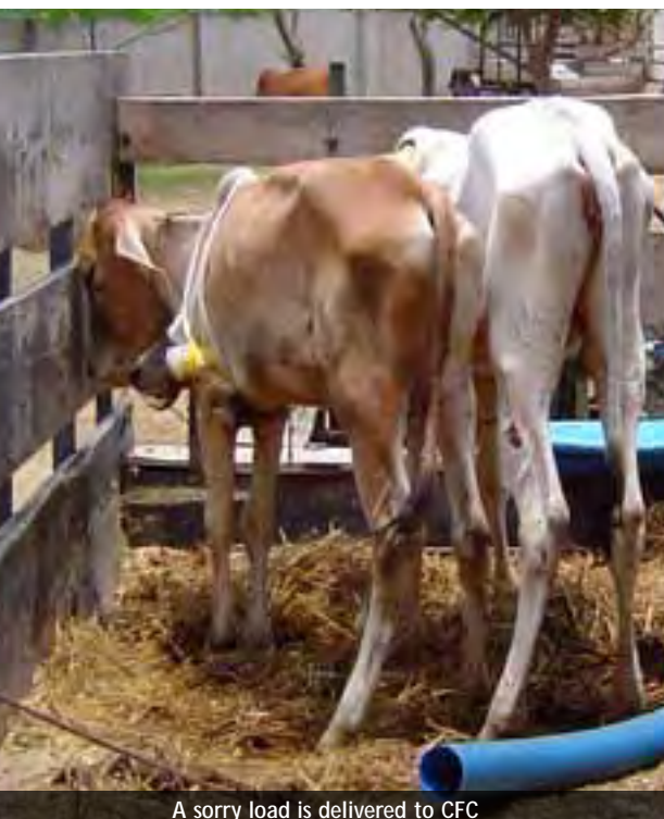
A sorry load is delivered to CFC