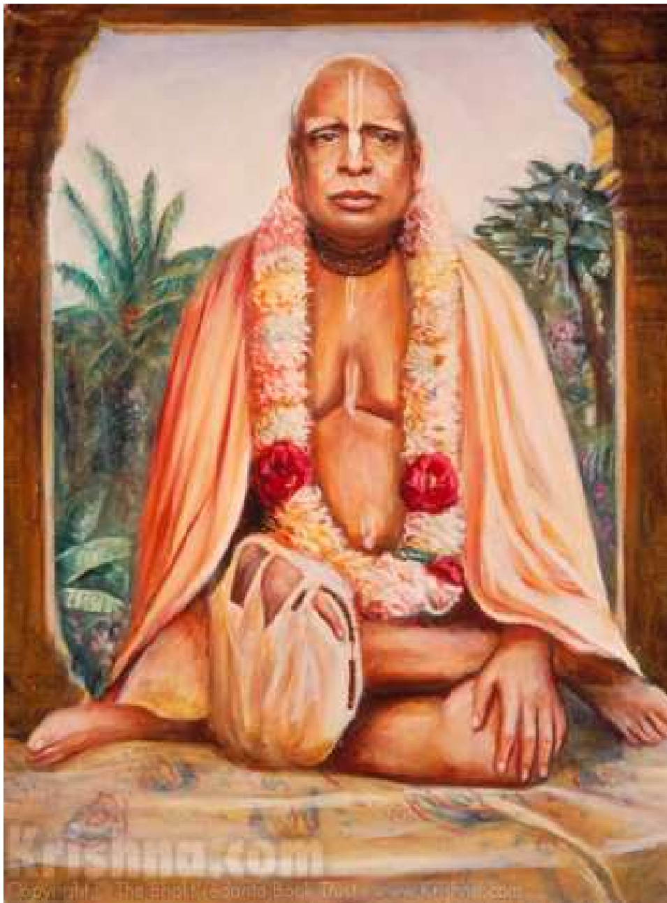
Srila Bhaktivinoda Thakur