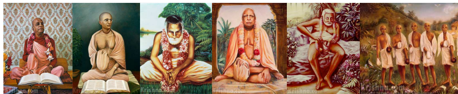
Srila A.C. Bhaktivedanta Swami Prabhupada