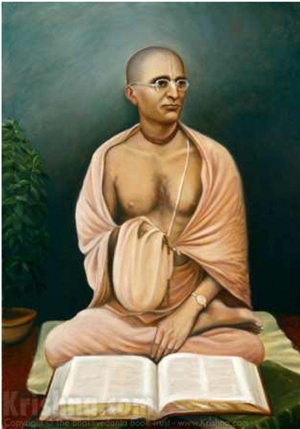
Srila Bhakti Siddhanta Saraswati Maharaj