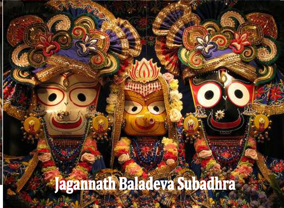
Jagannath Baladeva Subadhra