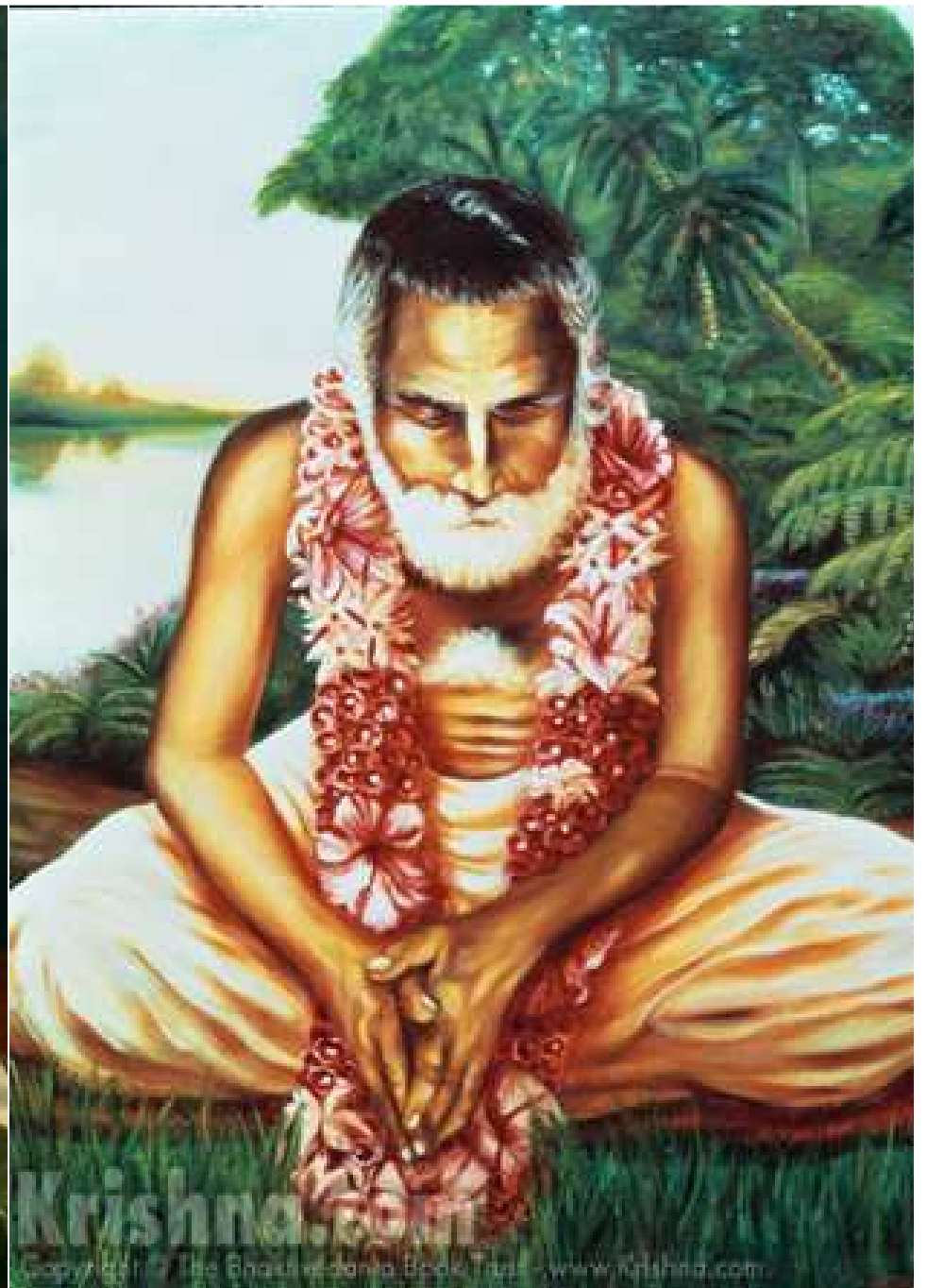
Srila Gaura Kishor Das Babaji Maharaj