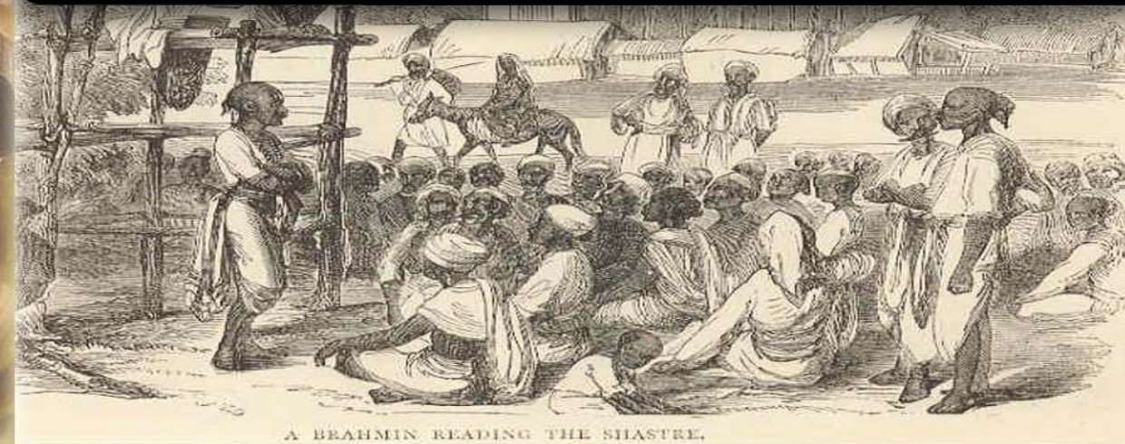
A BRAHMIN READING THE SHASTRE.