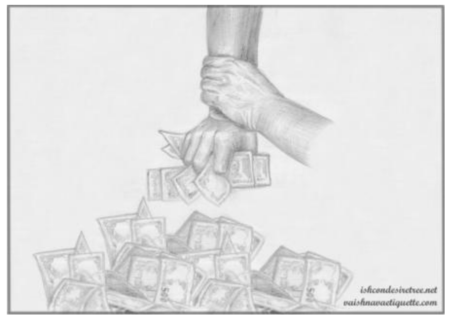
It is very good you have received permission for chanting and distributing literature as well as collecting. Now you should concentrate to develop your spiritual power to attract the fallen souls to Krsna consciousness. The daily regulative duties must be performed by everyone very strictly: the beads chanted sixteen rounds, and our literatures read and discussed. In this way, everything should be done very nicely. Sankirtana should be done by you in the streets and at gatherings and in this manner display what is this Krsna consciousness movement and how it is for everyone's eternal welfare and happiness. So you do all these with great enthusiasm and very carefully. Our all activities must be open so that no one may criticize our mission. So all dealings must be to the standard of Vaishnavism. We cannot misrepresent ourselves for the purpose of taking monies from the public, but as everything is undertaken forthrightly in a Krsna consciousness way, then Lord Krsna will be pleased to provide all facilities for aiding our such sincere service. SP Letter to Sridama (July 8, 1970)