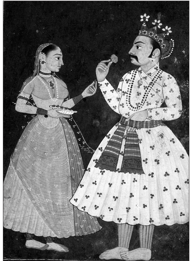
Queen Kunti with Maharaja Pandu

Later on, when the Pandavas were banished from the kingdom by the intrigues of Duryodhana,