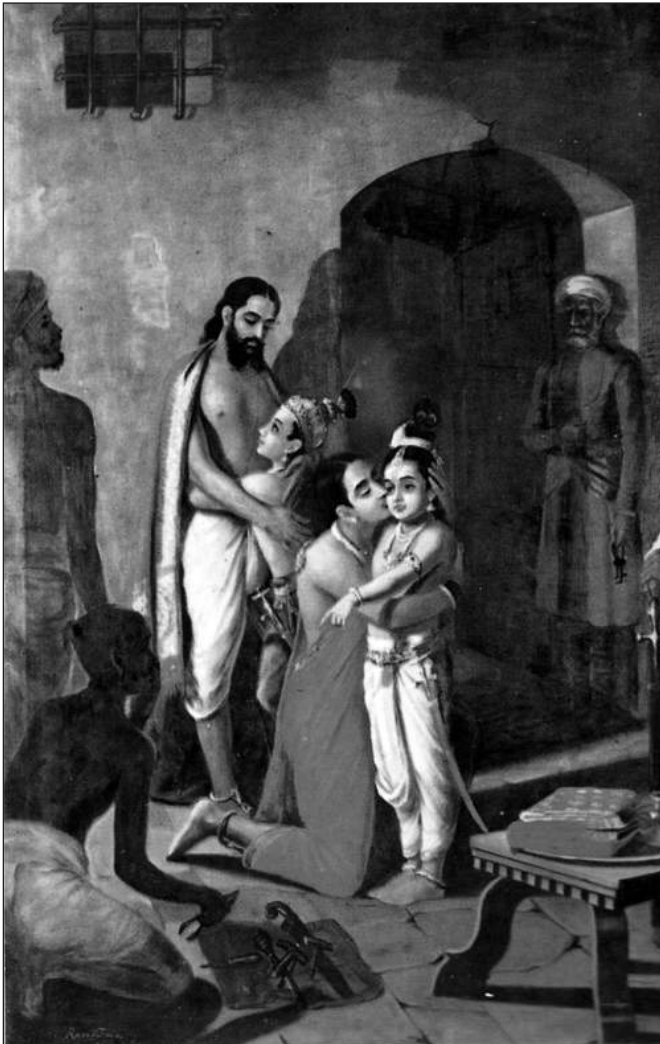
Krishna and Balarama meeting Vasudev and Devaki after killing Kamsa

Lord Krishna's father, Vasudeva, had sixteen wives, and one of them, named Pauravi or Rohini, the mother of Baladeva, was the sister of Vidura. Vasudeva, therefore, was the husband of Vidura's sister, and thus they were brothers-in-law. Vasudeva's sister Kunti was the wife of Pandu, Vidura's elder brother, and in that sense also, Vasudeva was brother-in-law to Vidura. Kunti was younger than Vasudeva, and it was the duty of the elder brother to treat younger sisters as daughters. Whenever anything was needed by Kunti, it was munificently delivered by Vasudeva, due to his great love for his younger sister. He had special attention for Kunti also because she became a widow at an early age..