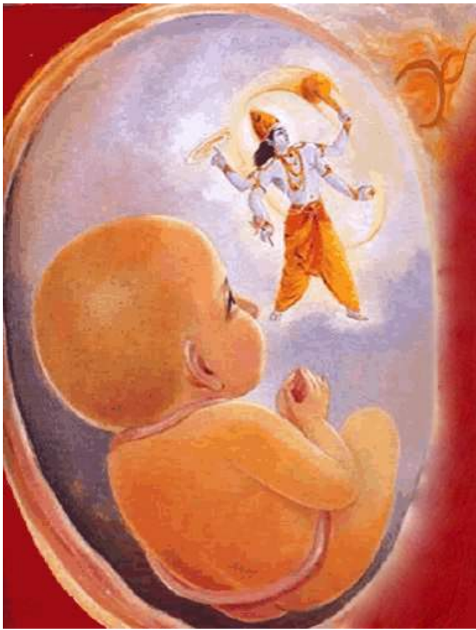
The Lord Krishna engaged in vanquishing the radiation of the brahmāstra