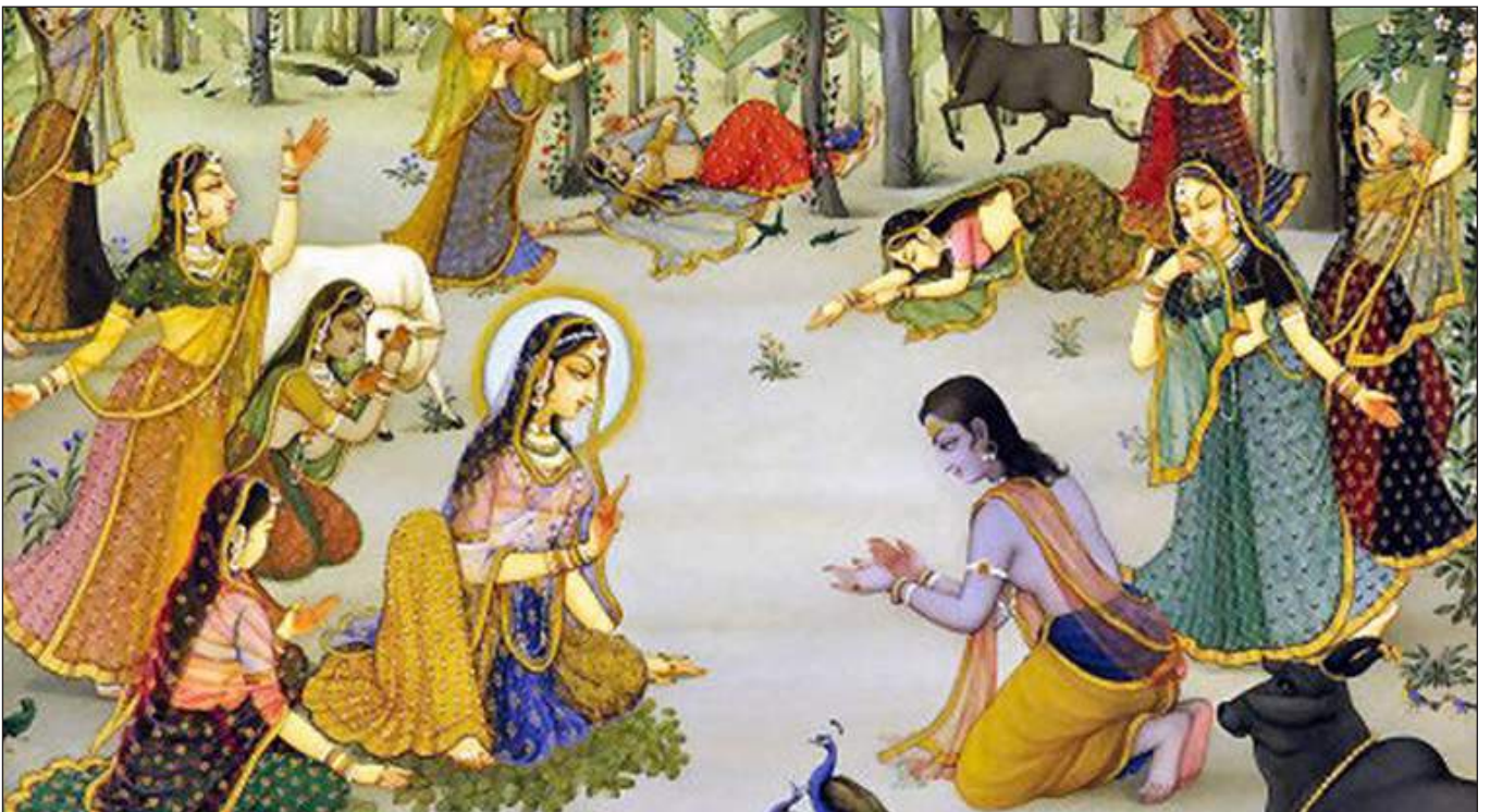
Sri Uddhava giving the teachings of Śrīmad-Bhāgavatam to the gopis

O Parikshit, I am therefore living here at