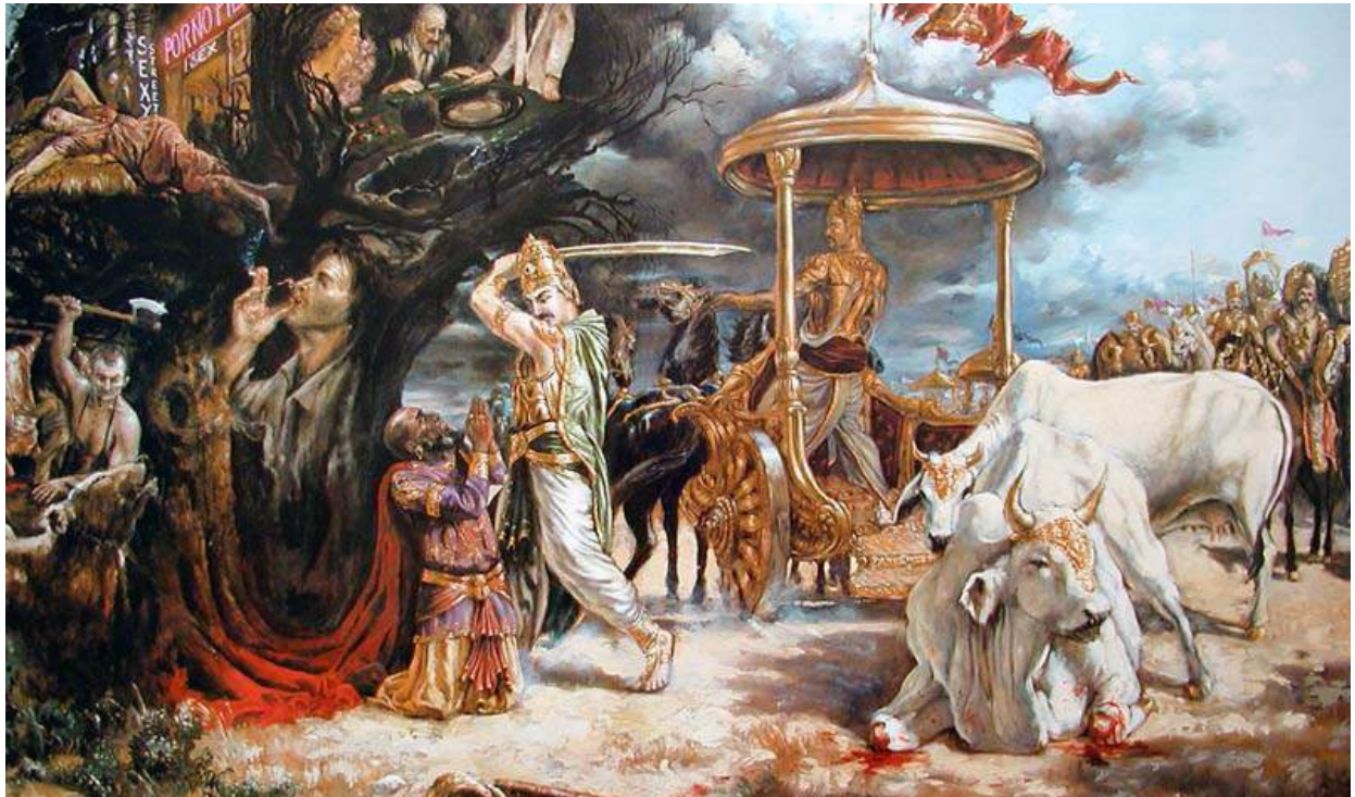
Maharaja Parikshit chastises Kaliyuga

places, where from time immemorial, adharmā is well entrenched. Gambling means wagering with dice, drinking of alcohol, women and violence. Wherever adharmā takes place in these four factors, Kaliyuga was told to reside there only.