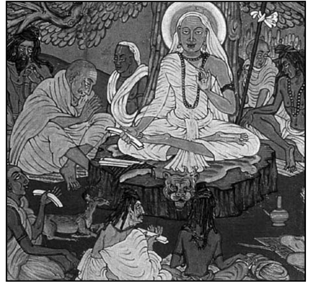
Painting by Nandalal Bose, 1953

Accompanied by his disciples and expounding his commentaries far and wide, once Shankaracharya came to understand through his mystic power that the last days of his mother had come. Informing his disciples of his intention, he traveled through the air to his native place, Kaladi, to fulfill a promise he had made to his mother to go and see her at her deathbed.