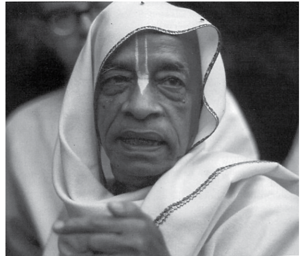
His Divine Grace A. C. Bhaktivedanta Swami Prabhupada

First of all let me offer my respectful obeisances to my spiritual master Om Vishnupad Srimad Bhaktisiddhanta Saraswati Goswami Prabhupada, then my respectful obeisances to the Supreme Personality of Godhead Lord Chaitanya Mahaprabhu, who is associated with Sri Adwaita Prabhu, Nityananda Prabhu, Gadadhar Prabhu, Srivas Prabhu, their eternal assistants the Six Goswamis — Srila Rupa Goswami, Sanatan Goswami, Raghunath Bhatta Goswami, Gopal Bhatta Goswami, Sri Jiva Goswami, and Raghunath Das Goswami, as well as his private secretary Sri Svarup Damodar Das, and his eternal attendant Govinda.