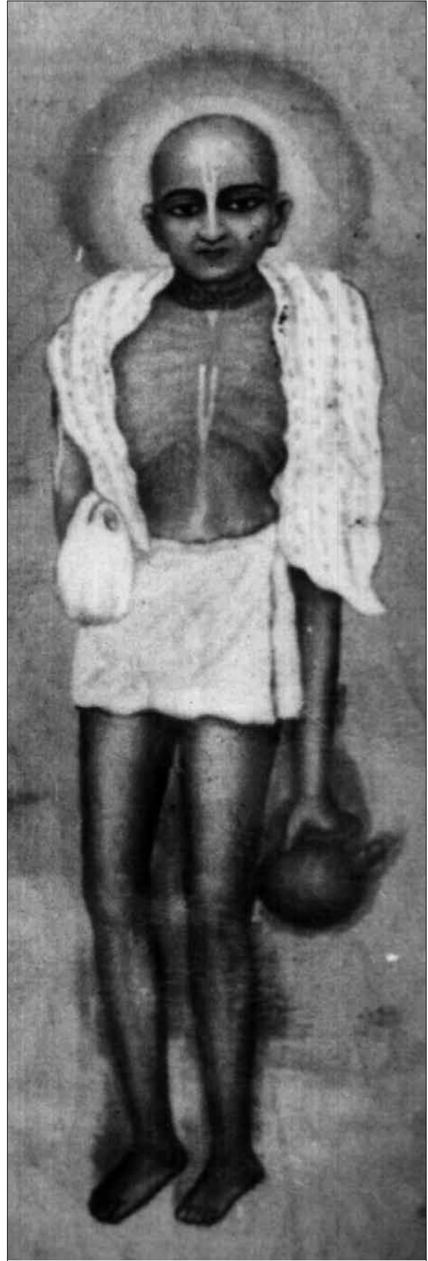
Srila Sanatan Goswamiṇpad

Quotations from the books, letters, and lectures of His Divine Grace A. C. Bhaktivedanta Swami Prabhupada ©Bhaktivedanta Book Trust International. All other materials, unless specified, © ISKCON Bhubaneswar/Gopal Jiu Publications. All rights reserved. Blanket permission is given to redistribute Bindu in electronic or print form provided no changes are made to the contents.