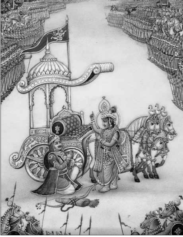
Krishna speaks the Gītā to Arjuna

vedair adhītaiṛ yat puṇyaṁ setihāsaiḥ purātanaiḥ ślokenaikena tat puṇyaṁ labhate nātra saṁśayaḥ ābrahma-stamba-paryantāṁ jagat-ṛptiṁ karoti saḥ viśva-rūpaṁ sadādhyāyaṁ vibhūtiṁ ca paṭhet tu yaḥ