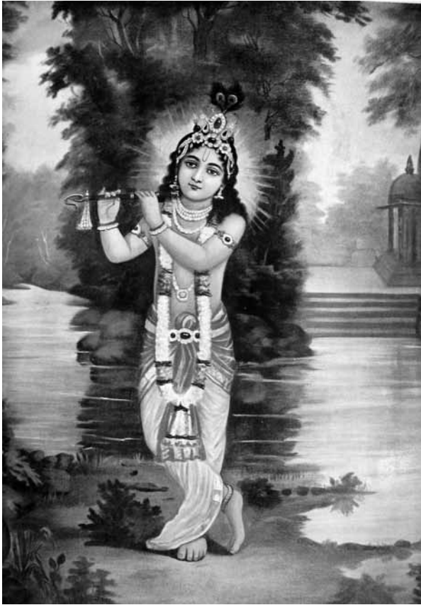
Vrindavan Bihari Krishna

Unknown artist, Gita Press, Gorakhpur, C. late 1920s