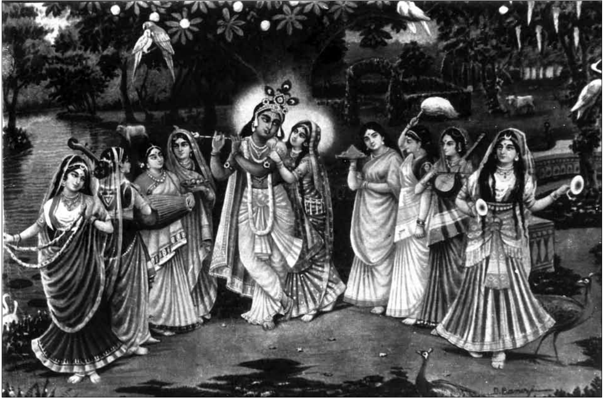
Spring in Vrindavan

Who can show you the lotus feet of Krishna? Who can lead you to the lotus feet of Krishna? Who can give you the clue how to see or approach the lotus feet of Krishna? That is guru, a premī-guru , premī-bhakta , a dear devotee who has established a loving relationship with Krishna. He is day and night, twenty-four hours, engaged in the loving service of Krishna. Only such a guru who has bound up Krishna in his heart with the rope of love can lead you to the lotus feet of Krishna, because he is a very dear and intimate associate of Krishna. Such a personality is a rādhā-prīya-sakhī , a very dear girl companion of Srimati Radharani.