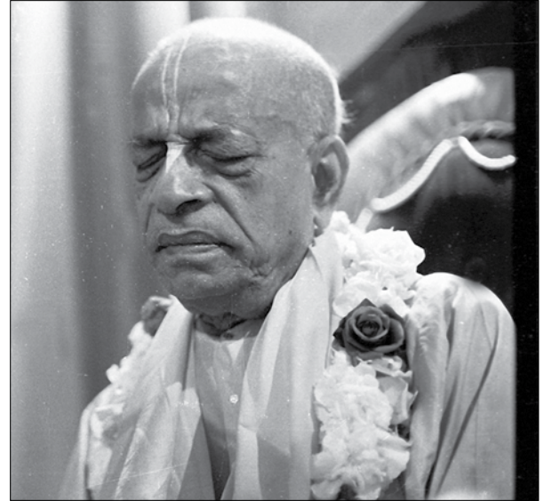
His Divine Grace A. C. Bhaktivedanta Swami Prabhupada