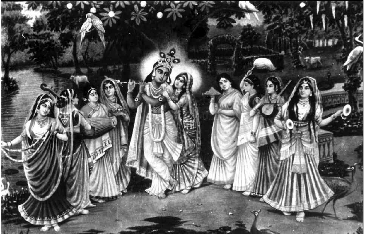
Painting by D. Banerji

In other words, as a dung-patty initially covers up the fire in which it is placed but ultimately becomes its fuel, the gopīs suppression of desires will ultimately become a catalyst for arranging a meeting with Krishna again.