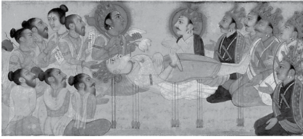
Yudhisthir hears from Bhishmadev

(antya 3.532) Srila Vrindavan Das Thakur has written, dui sthāne bhāgavata-nāma śuni-mātra — there are two bhāgavatas , the book Bhāgavata and the bhakta , devotee bhāgavata . We serve the book Bhāgavata by hearing from the bhakta-bhāgavata . Krishna tells Arjuna in the Ādi Purāṇa (quoted in Cc. madhya 11.28):