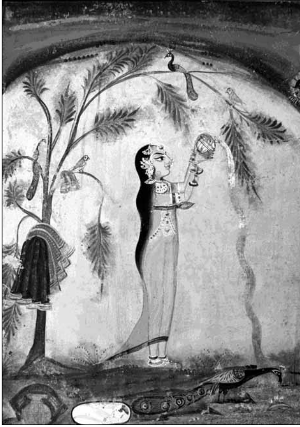
Radharani worships Suryadev

“When Sri Radhika attained youth among all these other gopīs who had attained youth, some ladies present at that time described it metaphorically as follows: