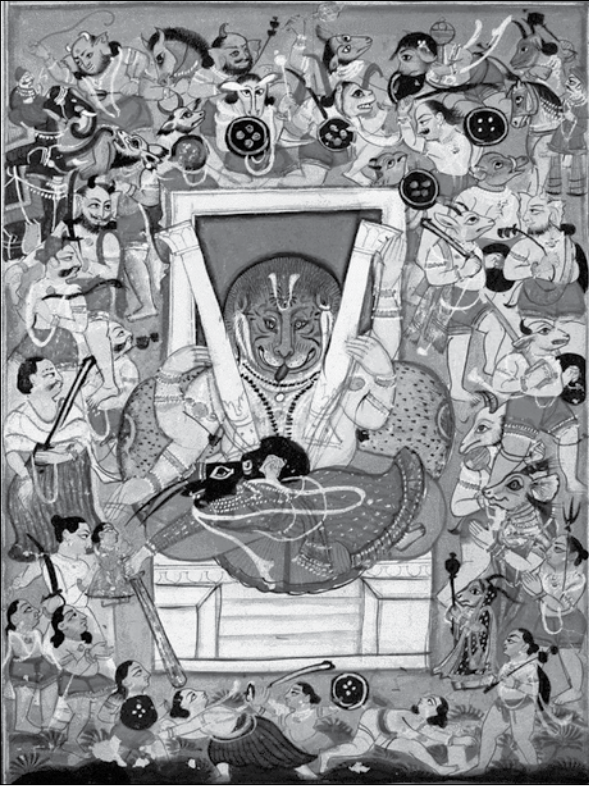
Nrisimha kills the daitya-king while Hiranyakasipu's army attacks

North Indian style. Unknown artist and date.