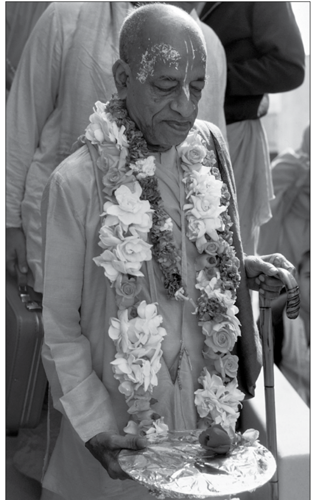
His Divine Grace A. C. Bhaktivedanta Swami

... [W]hen there is doubt you must go to a guru. Now who is a guru? The definition is there. Just like who is a medical practitioner. The medical practitioner is one who has passed his medical examination — that is his qualification — and he is actually working in some hospital. Then you can see, “Yes. Here is a medical practitioner.” Similarly, the Vedic injunction is that to clear your doubts you must go to a guru. Who is a guru? Brahma- niṣṭham — a guru is one who is fully convinced in the absolute truth. One who is fully Krishna conscious, he is guru. So you have to begin, “Here is a man who is talking only of Krishna consciousness.” Then he may be accepted. There may be pseudo-gurus. Just like you have to go to a physician, but if the man is a fraud, that is your misfortune. But God is in everyone's heart. He leads. If you are actually sincere and serious he will take you to the real guru. That is God's grace — guru-kṛṣṇa-kṛpāya pāya [Cc. madhya 19.151]. Krishna is also working. He is seeing