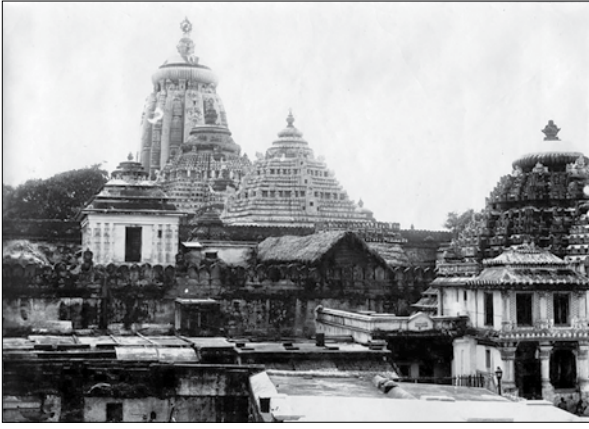
Jagannath Mandir in Puri in the 1890s

Jagannath's Bahudha, Return Ratha-yātrā , and if so, what was his mood?"