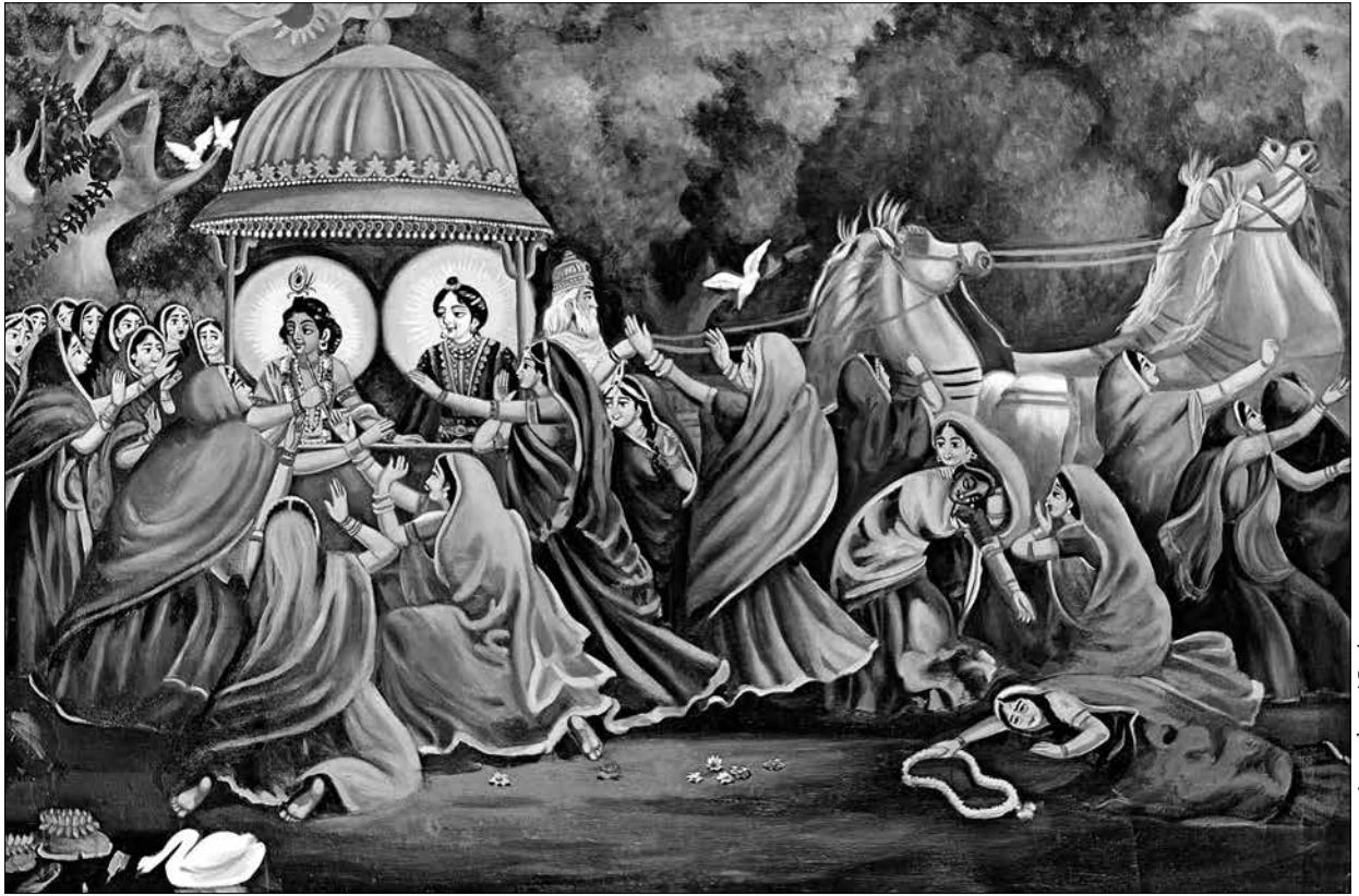
Painting by Yadurani Dasi