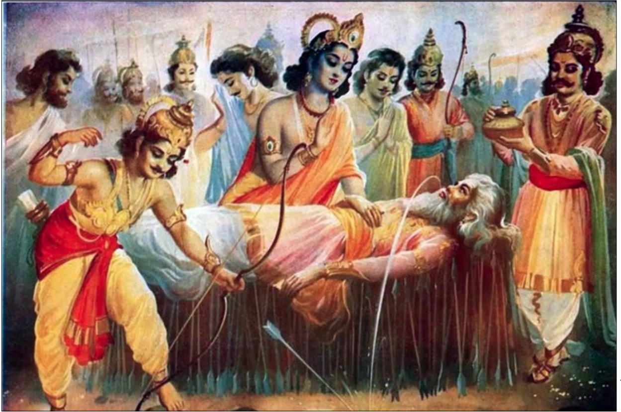
Bhishmadev surrounded by the Pandavas and Krishna as he lies on the bed of arrows