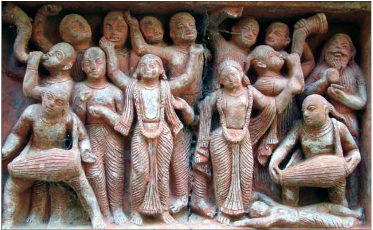
Unknown artist. Relief on the Gopinath Temple, Dasghara West Bengal