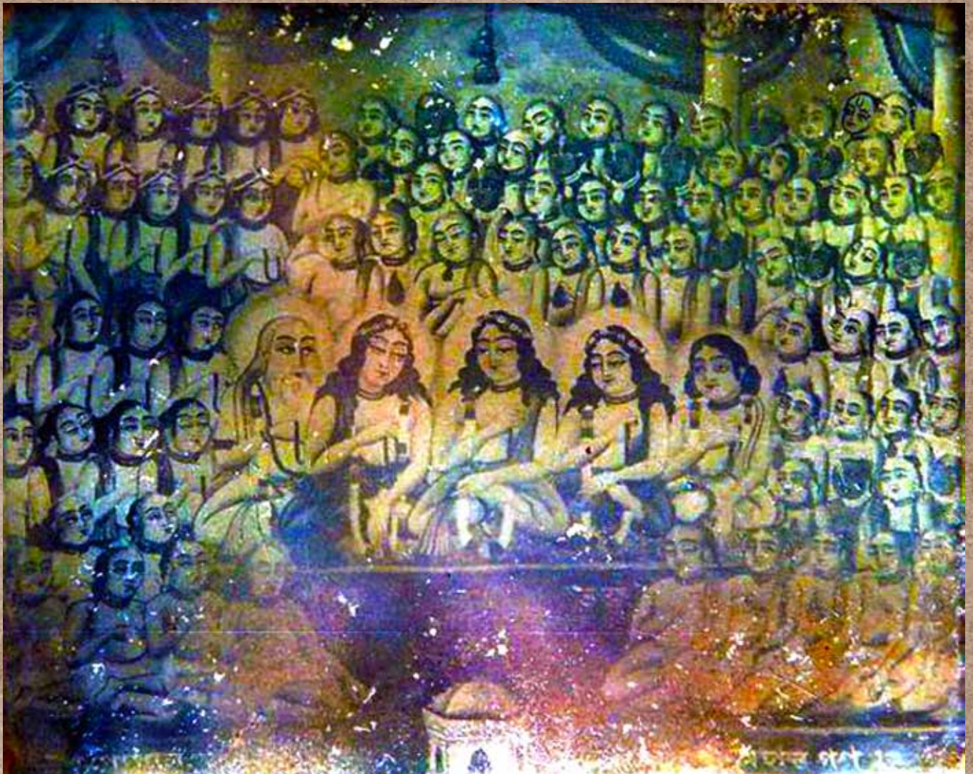
Mahaprabhu and his associates with the sixty-four mahants