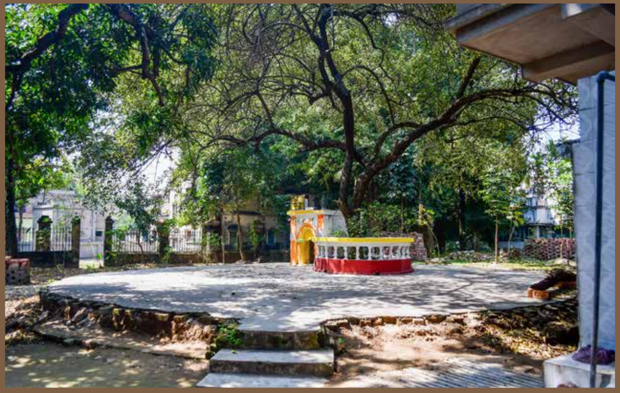
The place at Ambika Kalna where it is said that Lord Nityananda married the sisters Jahnava and Vasudha