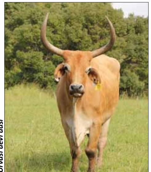
Urvasi devi dasi

contact Urvasi devi dasi who is only too happy to share all the cow love around.