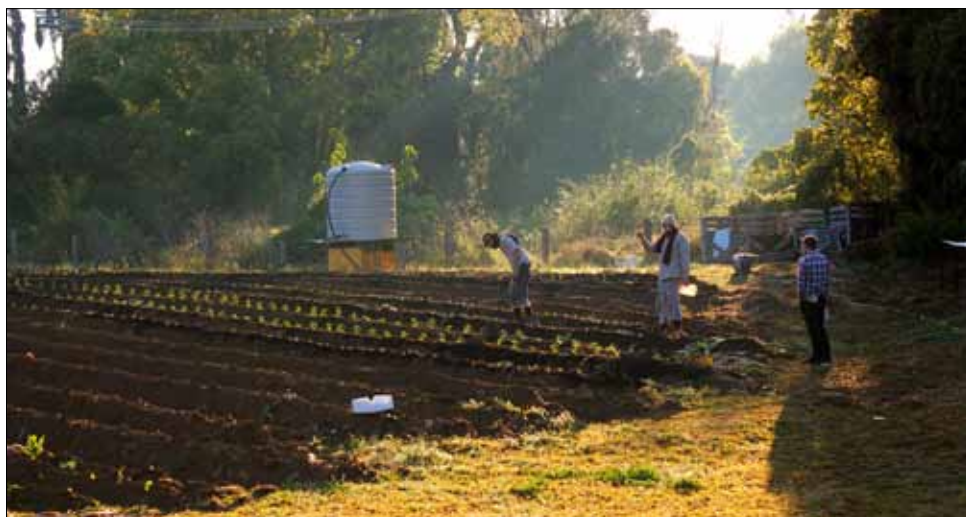
Crops being tended by WWOOFer residents of New GOvardhana

temple. The WWOOFing/volunteer program is progressing nicely with around 25 volunteers at work daily. Several have been living at New Govardhana for months. Each person brings their own unique set of skills that are being utilised in service for Krishna. The agriculture has flourished under this nurturing team and a remarkable supply of produce is grown. Approximately 20 boxes of vegetables are produced per week. This supplies produce for the temple and Govinda's Restaurant (Burleigh),