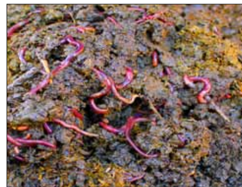
The power of, for example redworms (eisenia fetid), is staggering, and many people now own a "worm farm"

All the developments around the farm, especially agriculture, require the soil to be in a desirable condition. Tests have shown the farm soil to have many good qualities but is seriously lacking in carbon and organic matter. To regenerate the soil, the liquor produced from the worm farm is used as a natural fertiliser. At present one worm farm has been built, with the aim to build eight. Every eight weeks the worms produce one ton of worm casting which creates approximately 15 litres of liquor. The liquor is used to spray over the plants and soil.