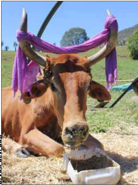
Urvasi devi dasi