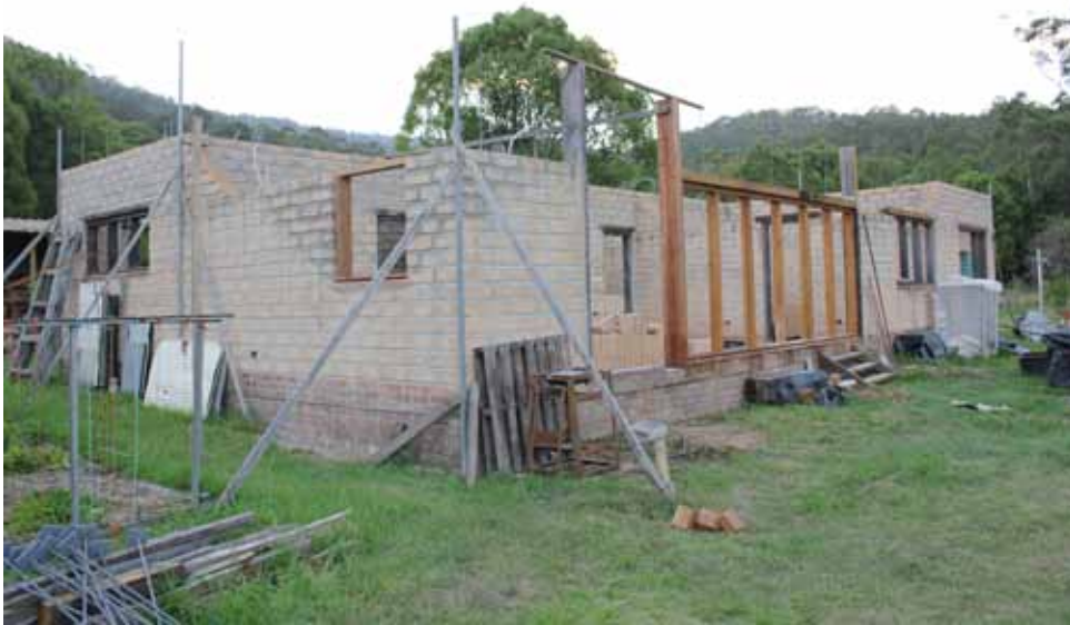
Urvasi devi dasi

Gokula dasa and Vilasa Manjari devi dasi have almost finished building the walls of their mudbrick house and expect to start on the roof very soon.