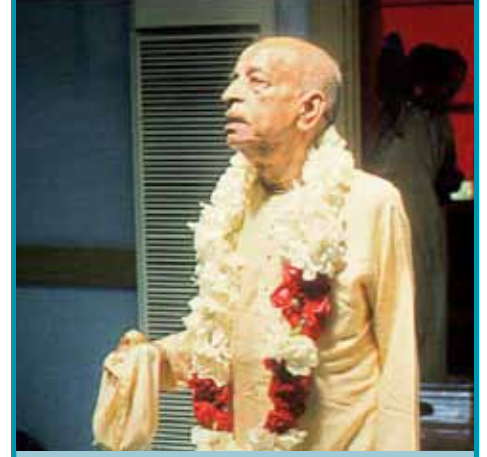
ISKCON Founder-Acarya His Divine Grace A.C. Bhaktivedanta Swami Prabhupada