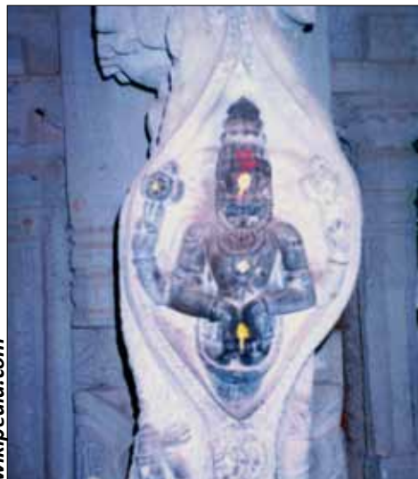
Lord Narasimha in a pillar at the Ahobilam Temple

Garuda wished for a vision of Lord Narasimha. To fulfill his wish, the Lord settled in the hills around Ahobilam in the midst of dense forests in nine different forms. For this reason this hill came to be known as Garudadri.