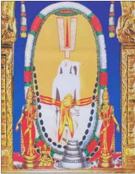
A painting of Sri Varaha Lakshmi Narasimha, the presiding deity at Simhachalam

Simhachalam temple is located near Visakhapatnam in Andhra Pradesh, South India. The presiding deities are Sri Varaha Lakshmi Narasimha. The word Simhachalam means the hill of the lion and refers to the 11th century temple of Lord Narasimha - an incarnation of Lord Vishnu who appeared as half man ( nara ) and half lion ( simha ), which partly fulfills a boon given by Lord Brahma to the demon Hiranyakasipu.