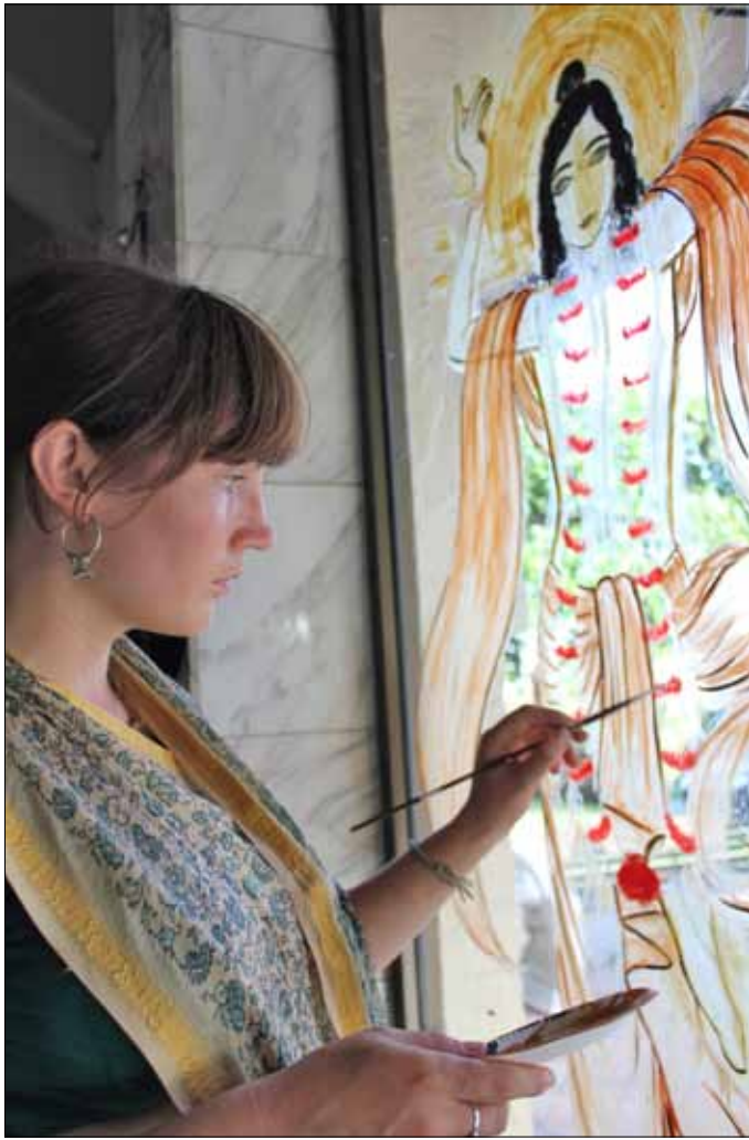
Urvasi devi dasi