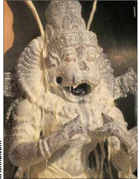
Narasimhadeva Sri Mayapur Chandrodaya Mandir