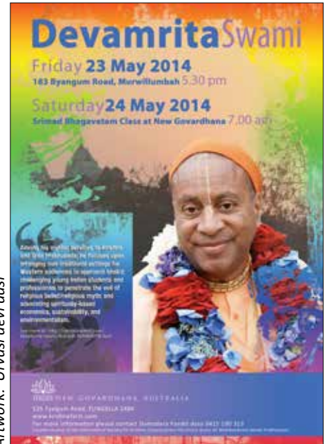
Artwork: Urvashi devi dasi

Srimad-Bhagavatam class. Program starts at 7.00 am.