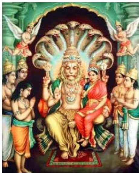
Lord Narasimhadeva is pacified by the prayers of Bhakta Prahlada.

With a tremendous roar that shook the universe, Lord Narasimha burst out of the pillar. Not recognising Him as his bitterest enemy, Hiranyakasipu was struck with wonder at the sight of this wonderful creature, who was half man, half lion.