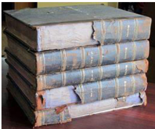
Full set of Srimad Bhagavatam, Murshidabad edition