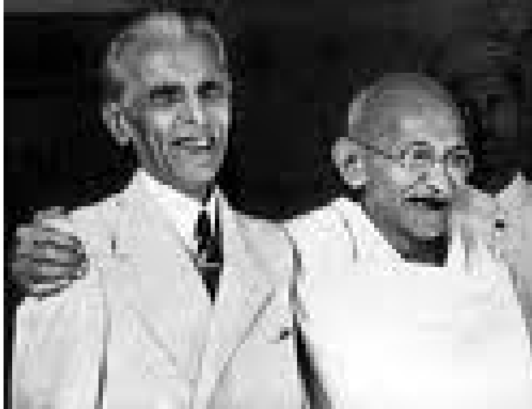
Jinnah, the first Prime Minister-to-be of Pakistan, with Gandhi, 1947.

as you may call it. But none of you neither your friends nor yourself knew this truth.” Letter mailed from Kanpur (Cawnpur) 12 July 1947