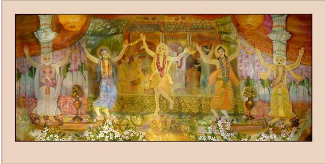
Srila Prabhupada inaugurates the Golden Age of Lord Chaitanya (San Francisco Ratha Yatra 1974)