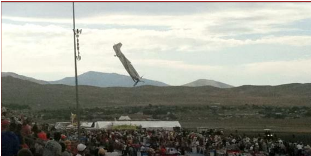
Horrified spectators gasped as the vintage P-51 fighter nose dived like a missile into the VIP stands at over 500 miles per hour.

“On September 16, 2011, at the Reno Air Races, a (WW2 fighter plane) piloted by James K. “Jimmy” Leeward crashed into spectators, killing nine people including the pilot, and injuring at least 69. Leeward, the 74-year-old pilot of a North American P-51D Mustang called The Galloping Ghost , was in fourth place and had just rounded the last pylon when the airplane abruptly pitched up, rolled inverted, then pitched down. The aircraft hit the tarmac in the front of the grandstands in an area containing box seating.”