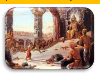
Prahlāda's Compassion reveals to us the finer intricate aspects of devotional service: