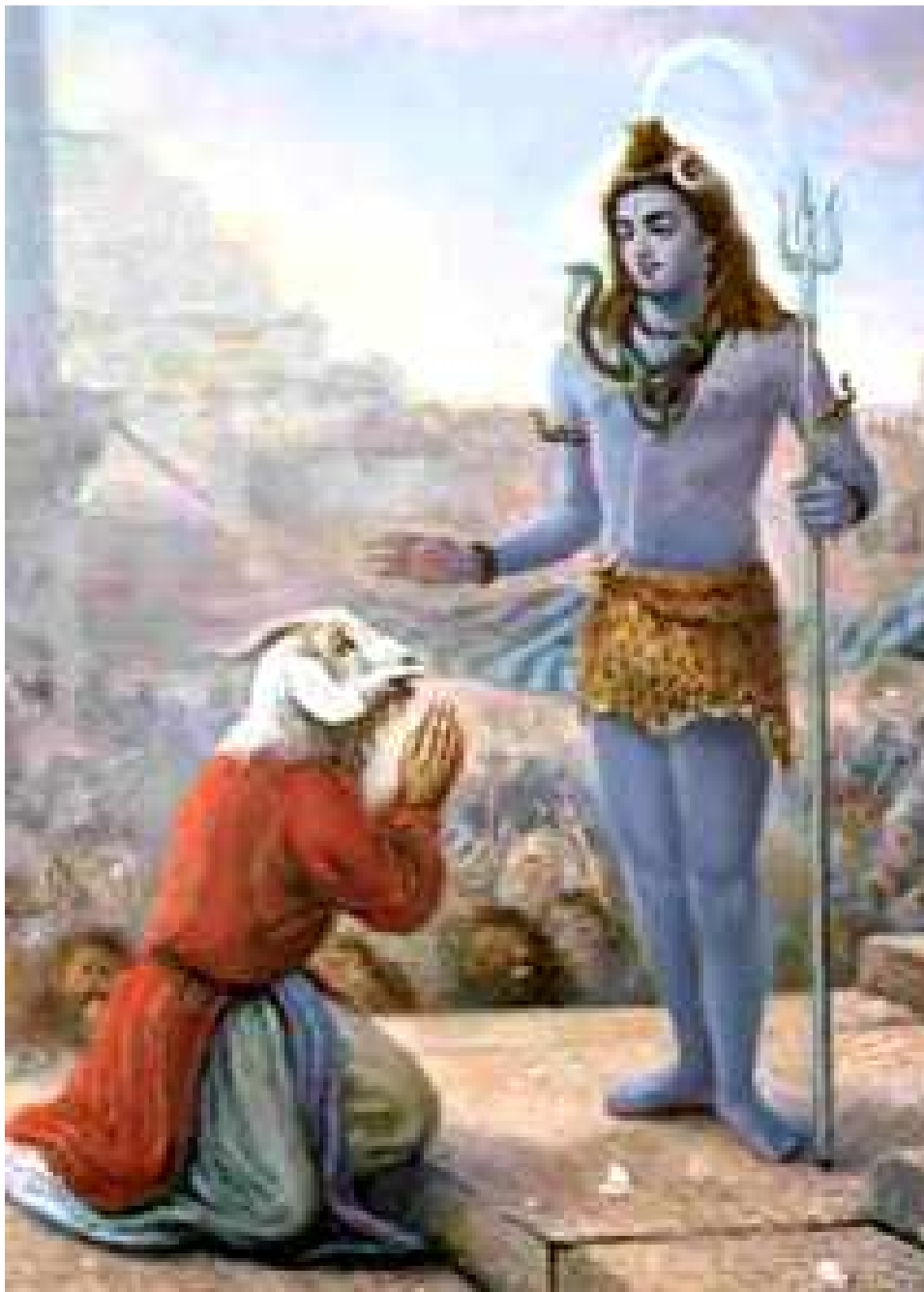
Later, Daksha received a goat head and he begged Lord Shiva for forgiveness.