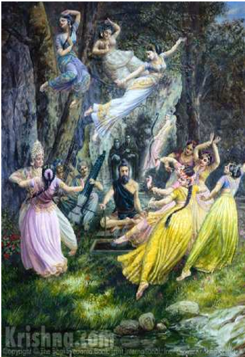
King Indra being envious of the Rishi, sent Kamadeva and his associates to interrupt Markandeya Rishi's austerities. But the Rishi defeated them by the potency generated from his penance.