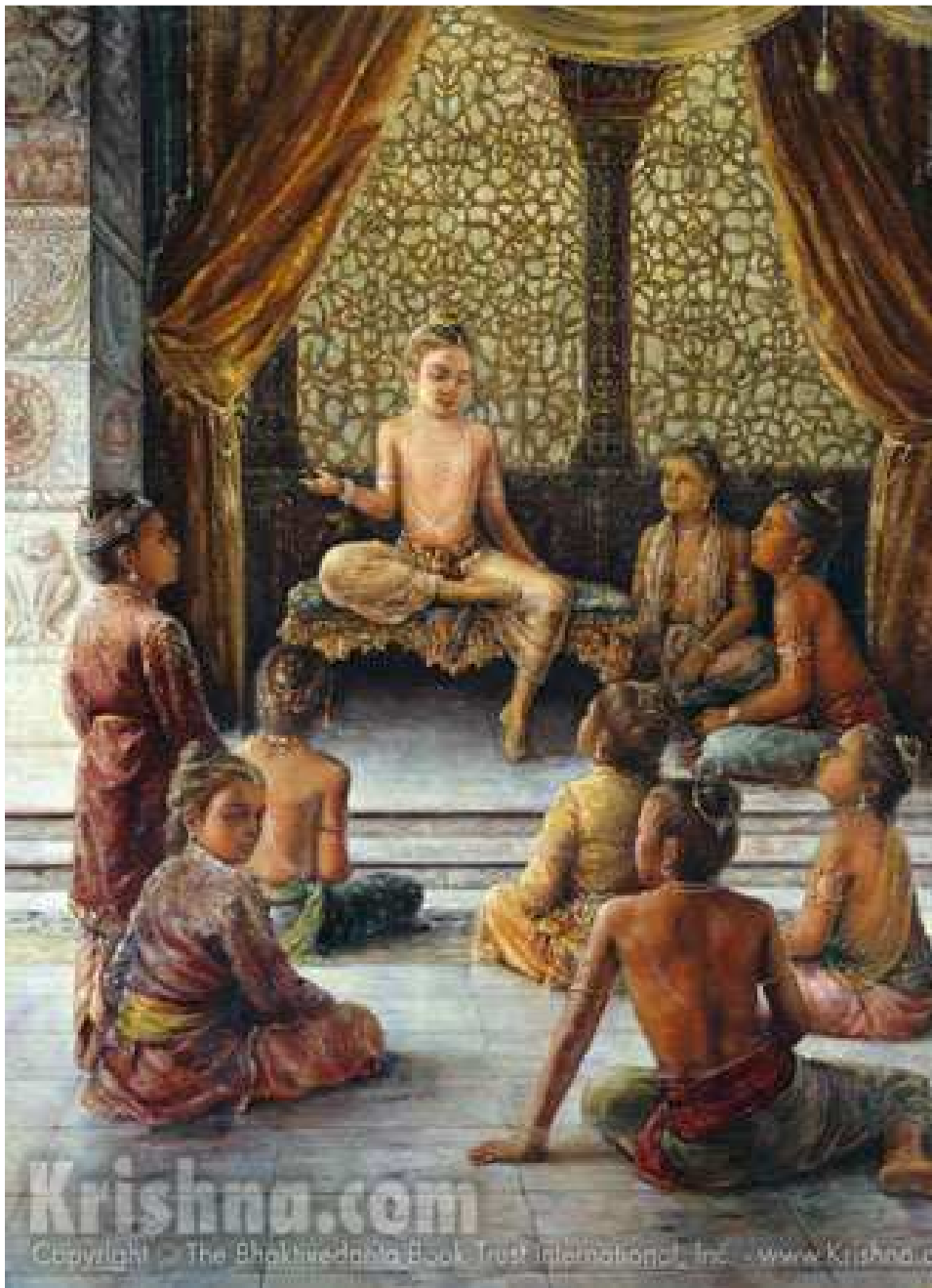
Due to Narada Muni's instructions, Prahlada Maharaj becomes a great devotee of Lord Vishnu. When Prahlada Maharaj was five years old, he preached to his school friends about Lord Vishnu.