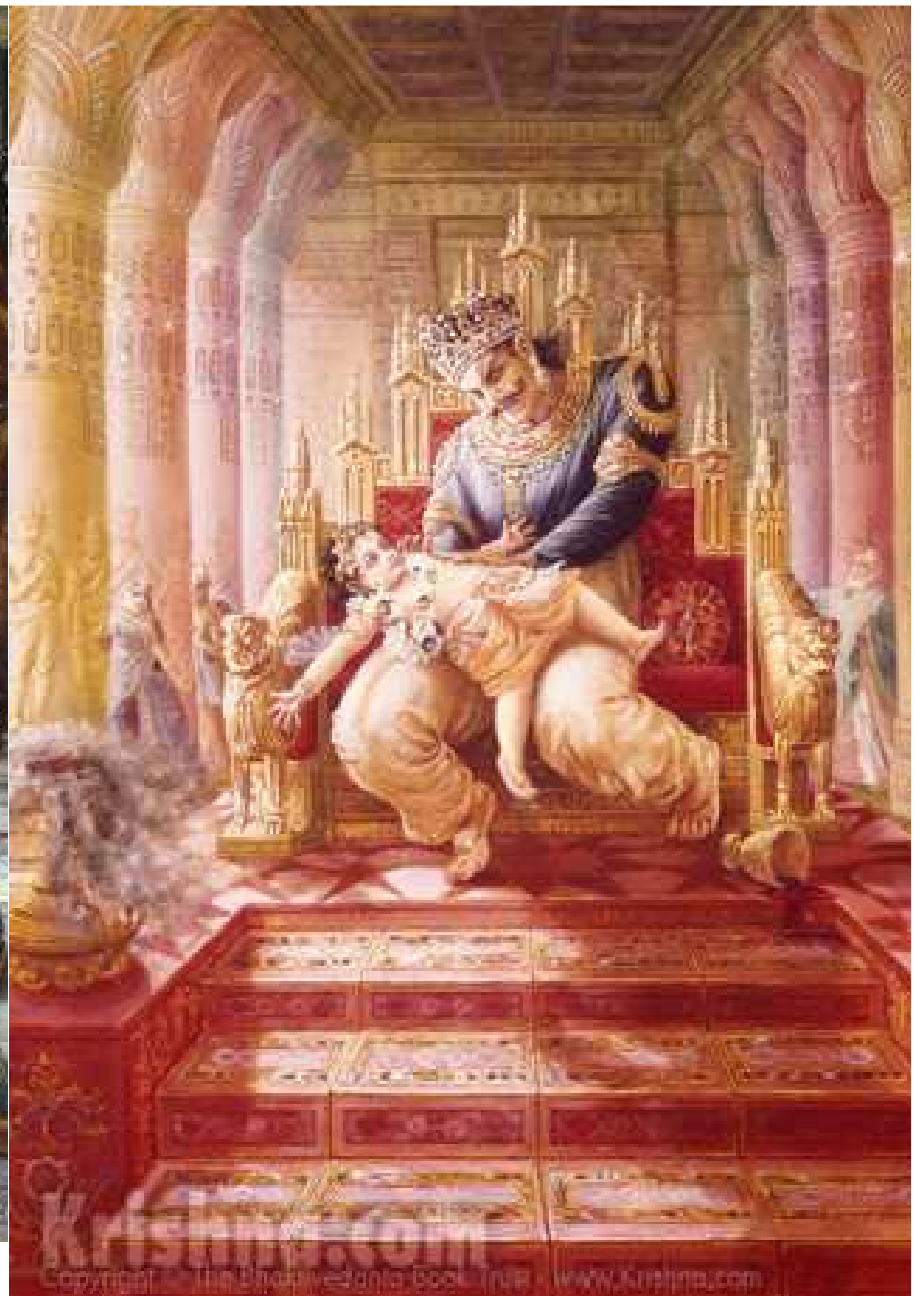
Hearing Prahlada Maharaj speak of Lord Vishnu, Hironyakashipu threw him from his lap.