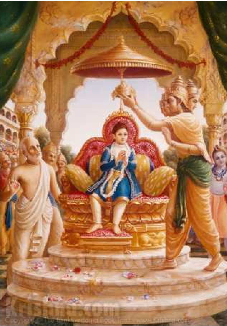
After Lord Narsimha disappeared, Prahlada Maharaj was installed on the throne of the world by Lord Brahma and Shukracharya.

gurudev! kṛpā-bindu diyā, koro' ei dāse, tṛṇāpekḥā ati hīna sakala sahane, bala diyā koro', nija-māne sprḥā-hīna sakale sammāna korite śakati, deho' nātha! jathājatha tabe to' gāibo, hari-nāma-sukhe, aparādha ha 'be hata kabe heno kṛpā, labhiyā e jana, kṛtārtha hoibe, nātha! śakti-buddhi-hīna, āmi ati dīna, koro' more ātma-sātha jogyatā-vicāre, kichu nāhi pāi, tomāra karuṇā-sāra karuṇā nā hoile, kāndiyā kāndiyā, prāṇa nā rākhibo āra