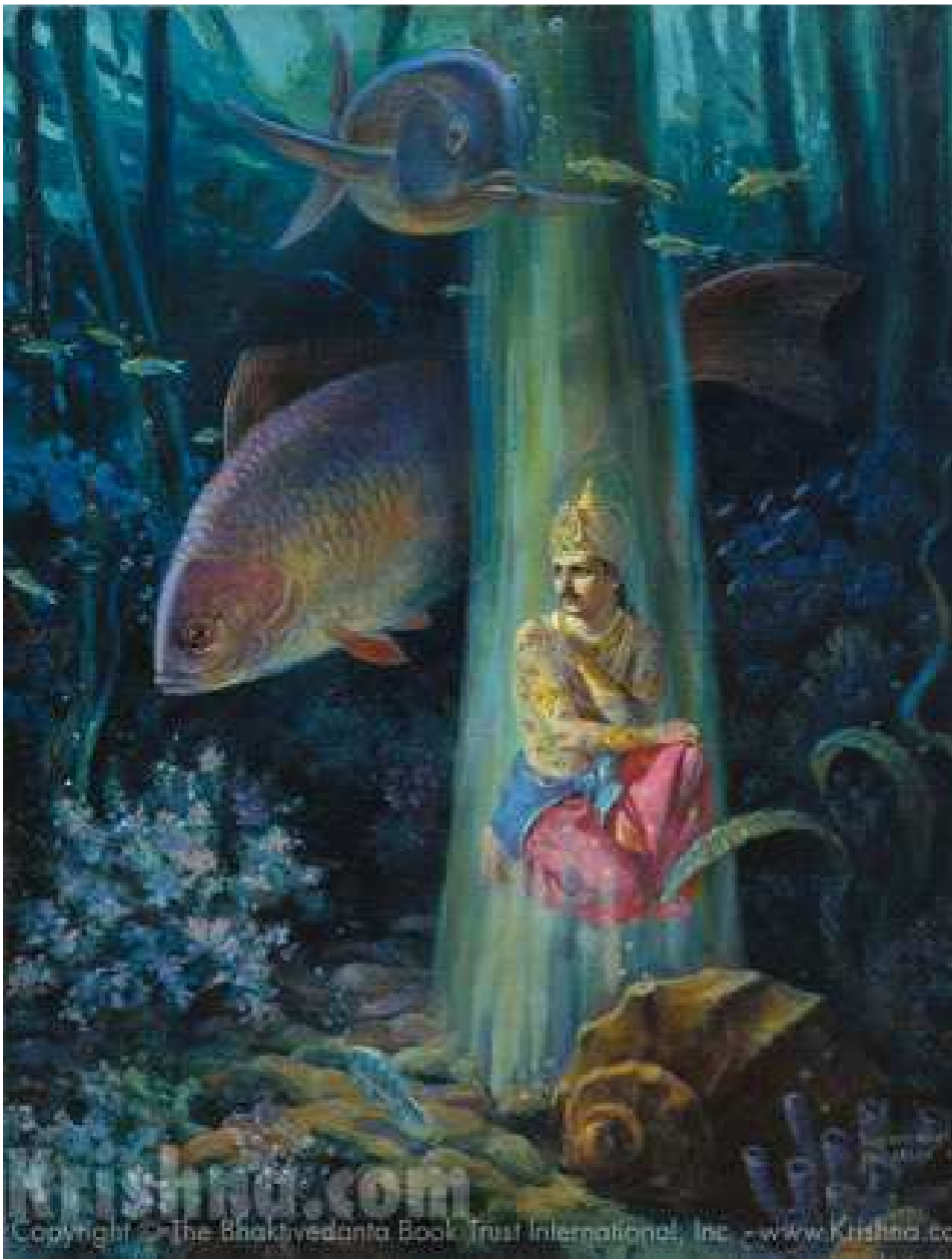
Fearing personified sinful reaction, King Indra lived in a lake for one thousand years in the stem of a lotus

nava gaura-varam nava- puspa-saram nava-bhava-dharam nava-lasya-param nava-hasya-karam nava-hema-varam pranamami saci-suta- gaura-varam