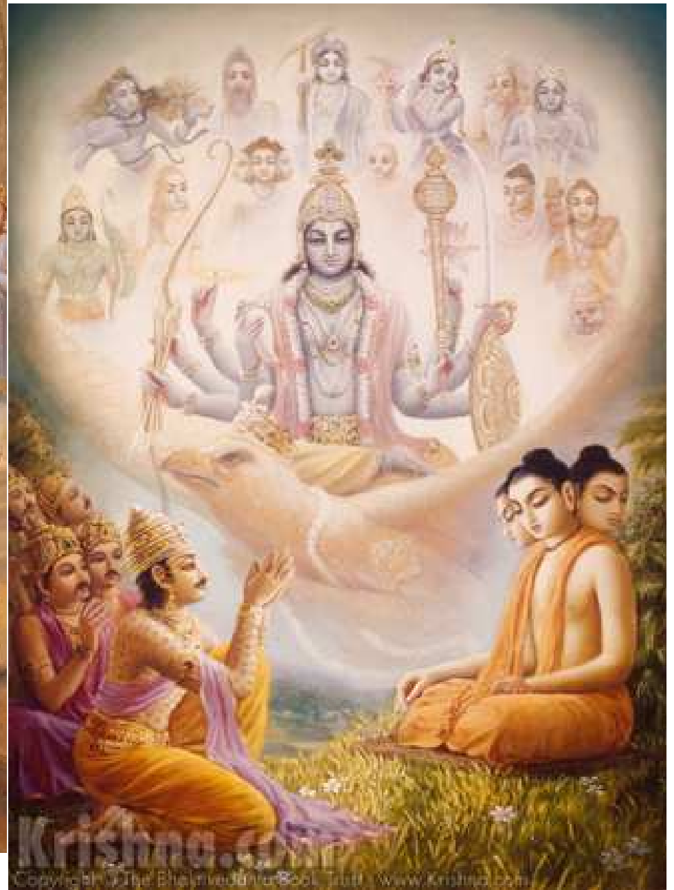
King Indra, along with the other demigods, took shelter of Lord Brahma. Following Lord Brahma's orders, the demigods accepted Vishvarupa, as their priest.