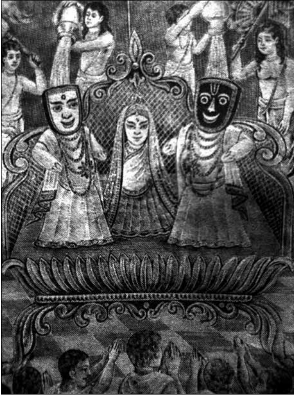
Jagannath, Baladev, and Subhadra

With these thoughts in mind, I began further research on the subject. As part of that research, I inquired from many sadhus and learned persons in Puri, including the King of Puri and many of the mahunts, or spiritual leaders of various groups there.