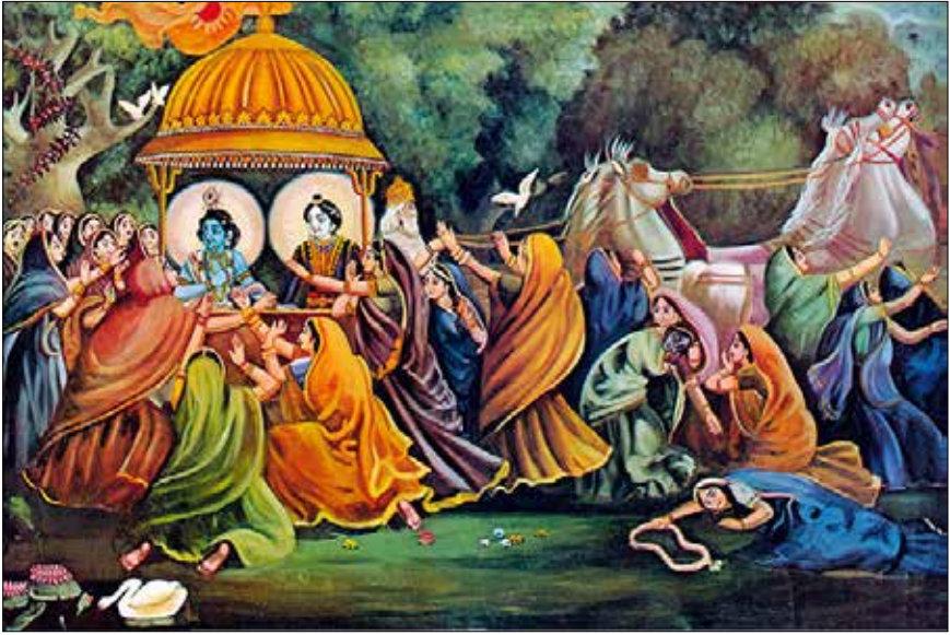
Krishna leaves Vrindavan and plunges the gopīs into an ocean of separation

Although they were experiencing the highest happiness of again meeting with their beloved Krishna. They also couldn't forget the fact that he had left them.