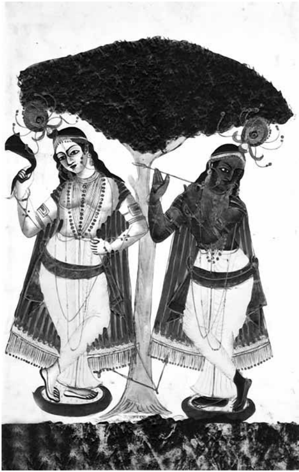
Balaram and Krishna

in all the three worlds who can conquer us. So please don't worry." Hearing this, Vasudeva and Devaki [who were aware of his opulences as the supreme] were relieved, but Rohini [who was always absorbed in maternal love free from any conception of Krishna's supreme position] was still in anxiety.