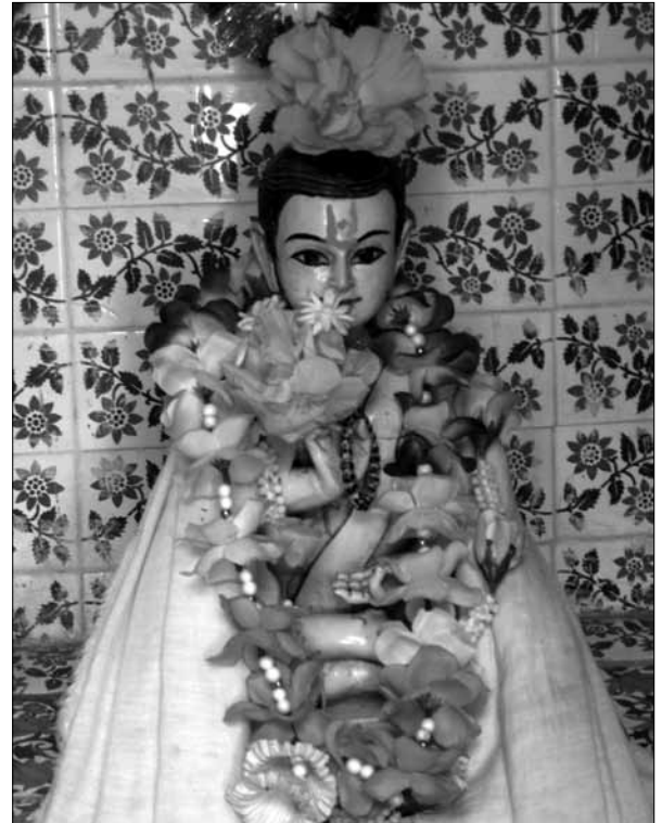
Deity of Syamananda Pandit in Narasinghpur

The next morning when the pūjārī came to wake the deity, he was surprised to find that Krishna’s flute was gone. He also couldn’t understand why