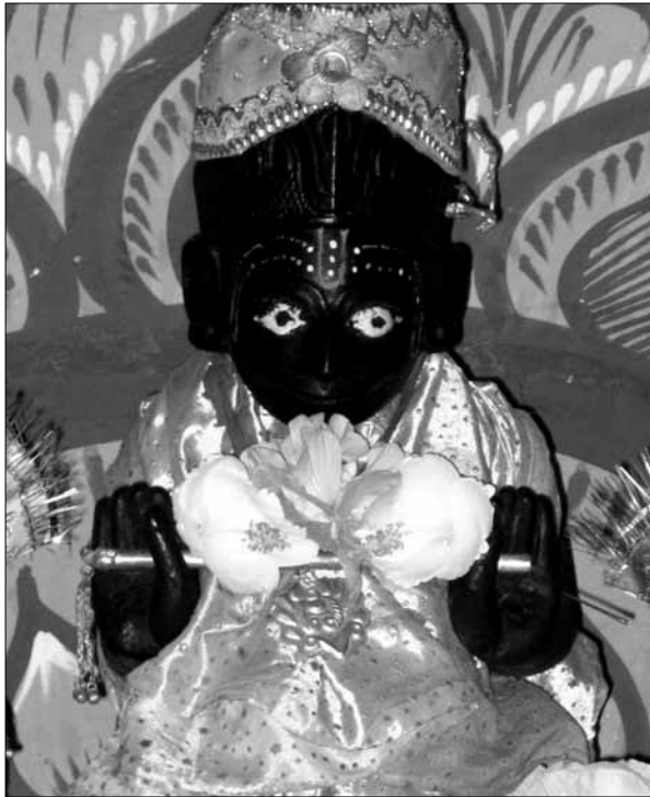
Close up of the deity of Mohanjiu

there was mud on the deity's hands and feet. Just at that time a villager came by and congratulated the pūjārī for plowing the field so nicely the night before. "What are you saying?" the pūjārī asked, "I didn't plow the field last night."