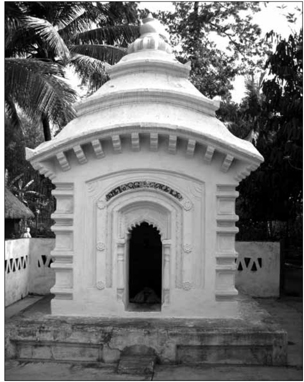
The samadhi of Syamananda Pandit in Narasinghpur

With the permission of his guru, Duhkhi Krishnadas later went to Vrindavan where he studied and engaged in service under the guidance of Srila Jiva Goswami. Jiva engaged him in the service of sweeping the Rasamandala, the place in Vrindavan where Radha-Krishna and the gopīs engaged in their rāsa dance pastimes. Once, while Duhkhi Krishnadas was cleaning the Rasamandala, he found an ankle bell of Srimati Radhika that had dropped from her foot while she had been dancing the night before. There are different accounts as to what happened after that. Some say that Lalita appeared there and pressed that ankle bell to his forehead and gave him the name Syamananda. It's said that Radharani's ankle bell created a special tilaka mark on his forehead. Devotees in the line of of Syamananda Pandit wear a similar tilaka mark.