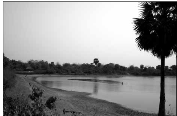
Top to bottom: The field that was once plowed by the deity of Mohanjiu; Syama Kund and Radha Kund established by Srila Syamananda Pandit