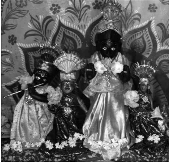
Deities at the temple in Narasinghpur. Sri Sri Radha Mohanjiu, are on the right.