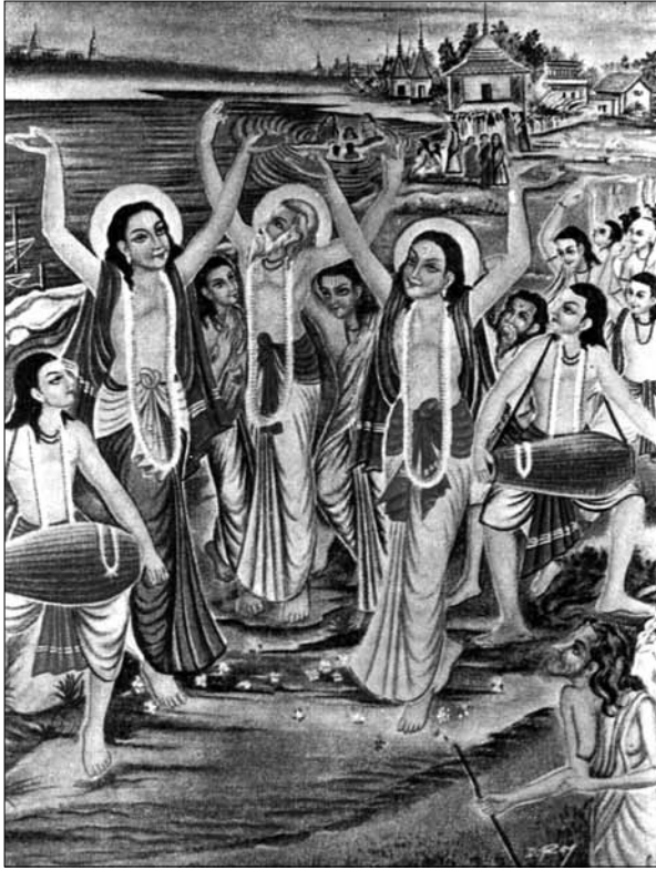
Mahaprabhu's prema-nāma saṅkīrtana

6) He never engages in wickedness while depending on the protection of the holy name.