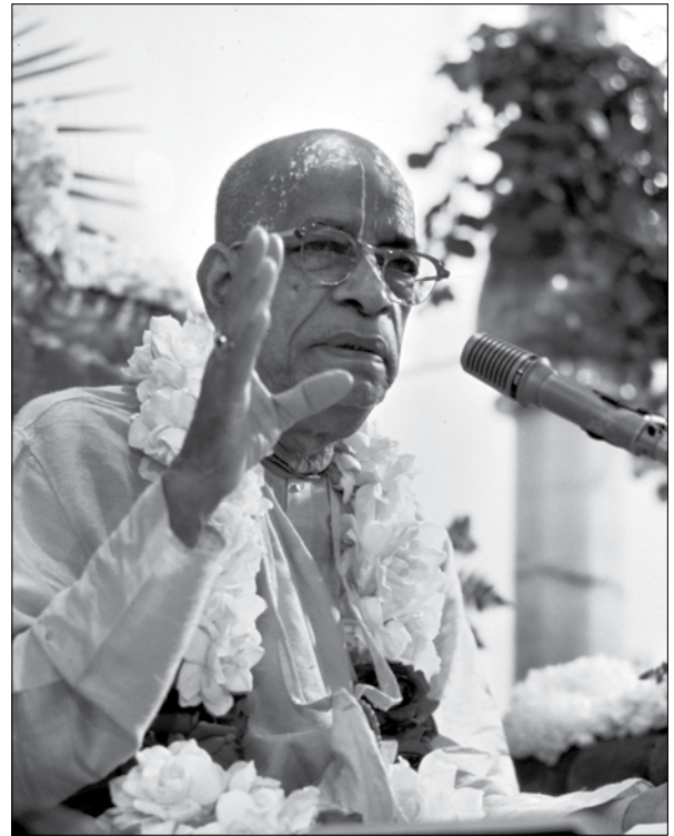
His Divine Grace A. C. Bhaktivedanta Swami Prabhupada

The first condition is that anyone who comes to Krishna consciousness as a bona fide initiated member, he gives up all these abominable habits: no illicit sex, no meat-eating, no gambling, no intoxication. They have given up even smoking cigarettes and drinking tea and coffee. After being qualified, they are accepted as vaiṣṇavas and properly initiated. So they cannot be neglected as not being brahmins. According to śāstra , they are qualified. Perhaps due to some past habits they may commit some mistake unconsciously. Consciously, no vaiṣṇava commits mistakes, but maybe due to habit. That is also protected by Krishna. api cet su-durācāro bhajate mām ananya-bhāk, sādhuḥ eva sa mantavyaḥ [Bg. 9.30]. Even there are some discrepancies, if the single qualification is there that he's sticking to Krishna consciousness rigidly, then he is a sādhu — sādhuḥ eva sa mantavyaḥ . So according to the explanation given by Rupa Goswami, as supported by Lord Krishna himself, as supported by Shukadev Goswamī, as supported by Sanatan Goswamī, as ordered by Chaitanya Mahaprabhu, these European and American