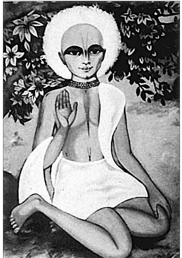
Srila Jiva Goswami

In this regard, Srila Sridhar Swami says in his commentary on Śrīmad Bhāgavatam (11.2.36) that one should offer all activities that are motivated by one's consciousness and ego. Activity in this context does not mean only those activities that are sanctioned by and enjoined in the scriptures. Rather, one should offer all