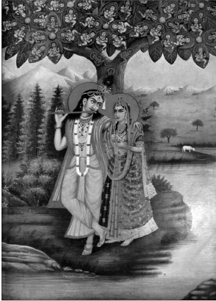
Sri Sri Radha Govinda

bound to be idle talk. That is why devotees always glorify hari-kathā . If we discuss kṛṣṇa-kathā , no one will have the opportunity to gossip. Those who are serious about worshiping Hari should neither hear nor speak worldly topics, nor should they pay attention to palatable foods or opulent dress. The desire to eat and dress opulently will certainly take us away from our worship of Hari. We cannot worship Hari as long as we desire to eat voraciously and dress attractively. Moreover, if we maintain a taste for hearing and speaking worldly topics, we will become distracted from the path of worshiping Hari. Such talks will misguide us and force us to forever relinquish our worship. Therefore persons who are interested in Lord Hari's service must be careful about such things. Otherwise they will inevitably fall down. (From Amṛta Vāṇī , "Devotional Service", anecdote 3.)