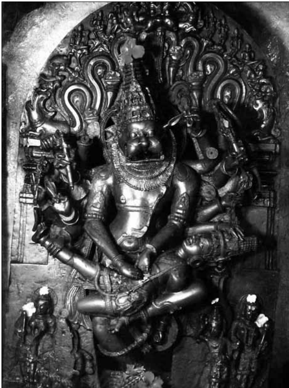
The deity of Jwala Nrsimha

dvau-vidāraṇa karmāṇau dvau cātrodधारणा-ḥṣamau cakra-śaṅkha-dharāv anyāv anyau bāṇa-dhamur-dharau