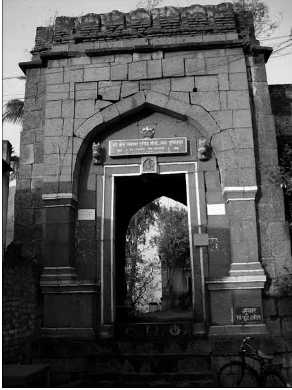
Eastern gate of the Jwala Nrsimha temple

khadga-kheṭa-dharāv anyau dvau gadā-padma-dhārīṇau pāsāṅkuṣa-dharāv anyau dvau ripor-mukuṭārpitau iti śoḍaśador-daṇḍa-maṇḍitam nṛharim vibhum dhyāyed-ambuja-nīlābhām ugra-karmāny-ananyadhiḥ