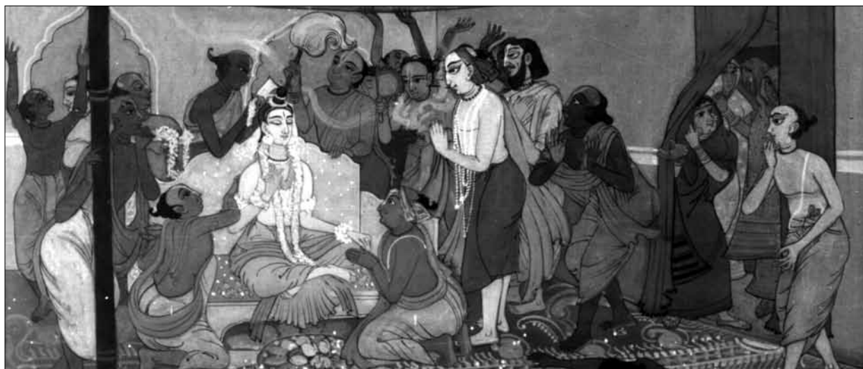
Santiniketan school. West Bengali. Early 1900s. Unknown artist.