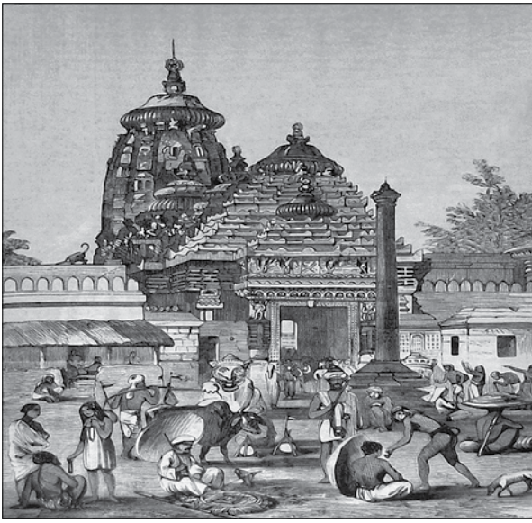
Jagannath Mandir in Puri, c. 1830

offer flowers, fruits, etc., to the deities. Then on the eighth day the Lord returns to his own place. This is the system, and care is taken to ensure that the great procession is complete with chanting, flowers, etc. If during ratha-yātrā you cannot keep the festival on the seaside then take the cart in procession to the river-side and come back on the same day. For the eight days, as far as possible, distribute prasadam , especially khicari . Then on the eighth day you also organize the ceremony in the same way. Please arrange to take nice photographs of your festival activities as well as of your other kīrtana activities. (Letter to Jayapataka. 21 June 1969.)