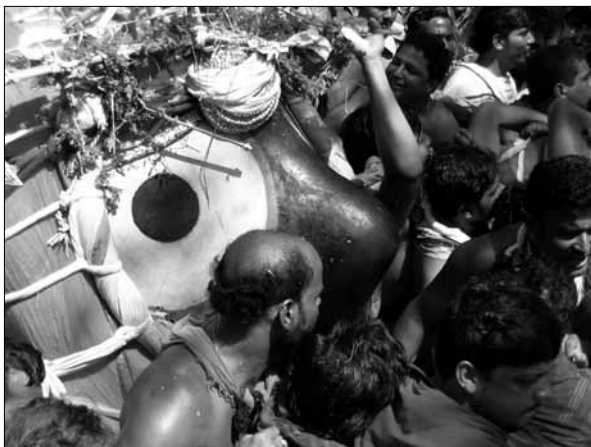
Lord Jagannath comes out of the temple

praphulla puṇḍarikākṣa lavaṇābhi-taṭāmṛta guṭikodara mām pāhi nānā-bhoga-purandara