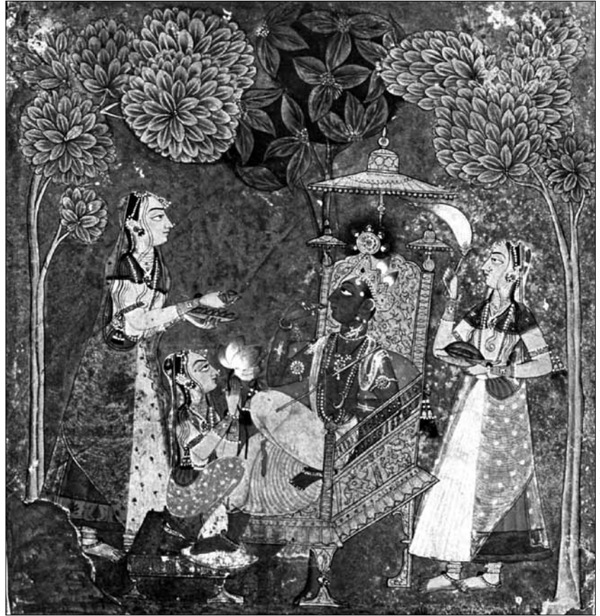
Ragmala Series, Basholi School, Circa 1710

Thus deeply considering the situation, the all-merciful Supreme Personality of Godhead Hari revealed to the cowherd men his abode, which is beyond material darkness. ( Bhāg. 10.28.14)