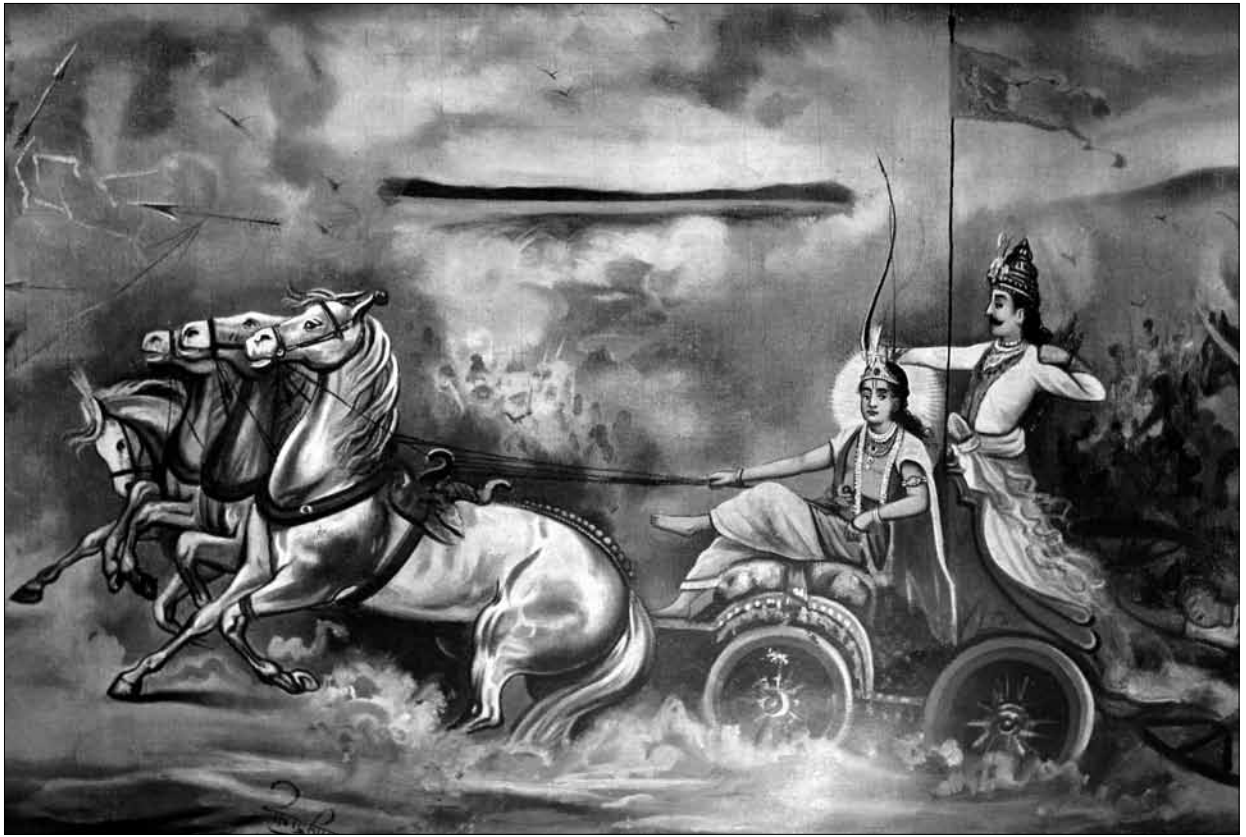
Gita Press painting. Unknown artist

Srila Vishwanath Chakravarti Thakur — [The Lord says,] “According to the described symptoms, simply by understanding in truth my birth and subsequent activities after birth, one becomes successful.”