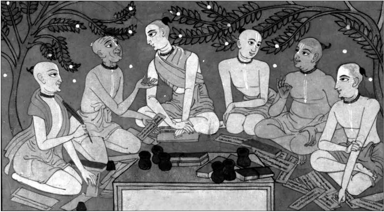
The Six Goswamis of Vrindavan

bestowing [of spiritual realization] occurs.” Thus, translating the term ‘ sampradāya ’ as a “narrow sect” actually proves that not only is much lost in translation, but much is also misunderstood.