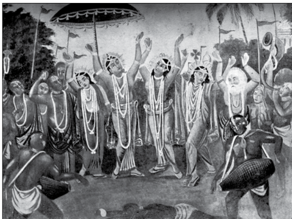
Mahaprabhu does kirtana with his followers

Govardhan and of course, most importantly, I have attained the desire and hope to render confidential service to Sri Sri Radha Madhava.