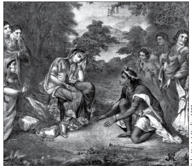
Calcutta Art Studio, 1883