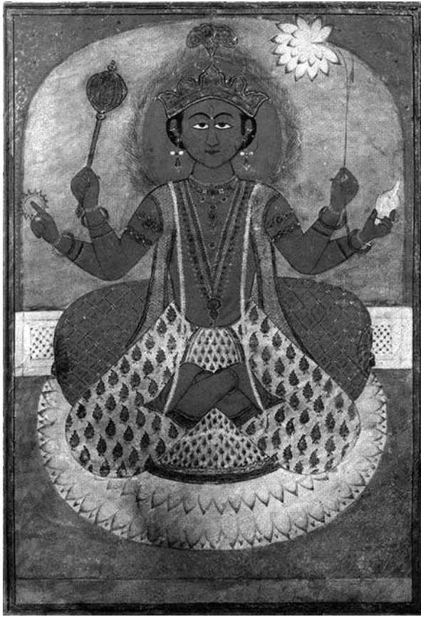
The Govinda form of Lord Vishnu in Vaikuntha

śaraṇam yātāḥ katham tārīs tyaktum utsahe — “Since pure devotees give up their homes, wives, children, relatives, riches and even their lives simply to serve me, without any desire for material improvement in this life or in the next, how can I give up such devotees at any time?”