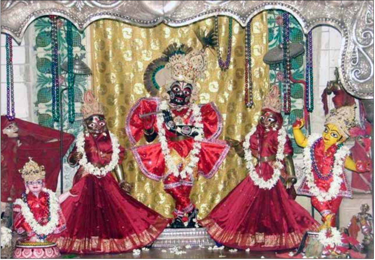
The deities of Sri Radhakanta worshiped by Vakreshwar Pandit in the Gambhira in Jagannath Puri

and after Mahaprabhu's acceptance of sannyāsa he also accompanied Mahaprabhu to Jagannath Puri. During the time of the Lord's residence in Puri he continued to live there as well.