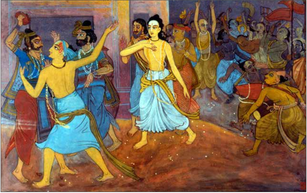
Painting by Kartick Biswas