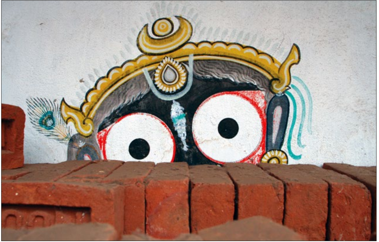
Wall painting in Jagannath Puri.

In Odisha, Jagannath is watching you from everywhere