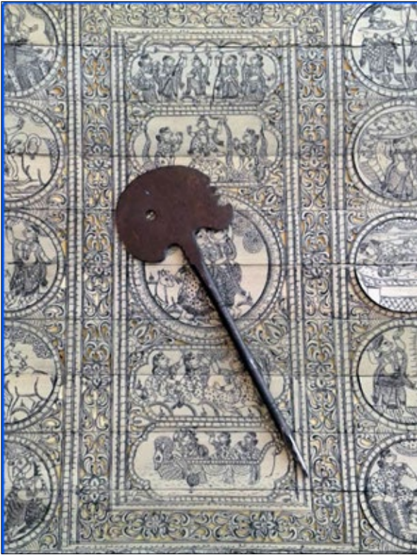
A traditional Odia palm-leaf picture called a Talapatra, and the iron pen used to engrave them called a lekhana.

Jagannath for the duration of the anavasara period and hence suffer pangs of separation, which are somewhat mitigated by being able to behold the anasara-paṭi .