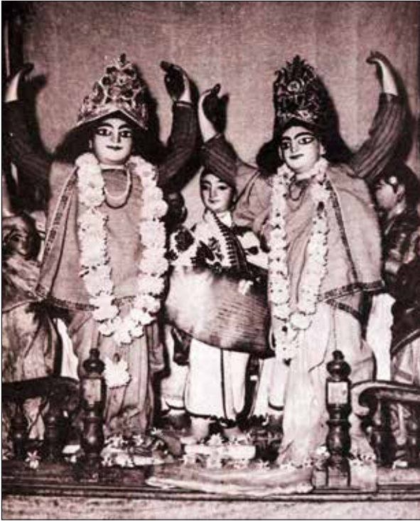
Deities of the Panca-tattva at Srivas Anga in Mayapur 1970

aruṇa-locane prema barikhaye abanī-maṇḍala siñca-i