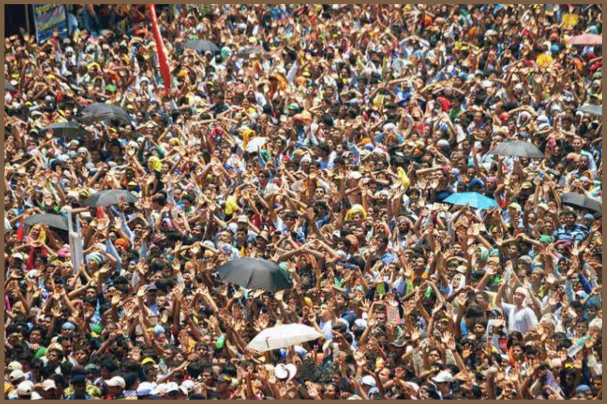
The crowd at Puri Ratha-yātrā