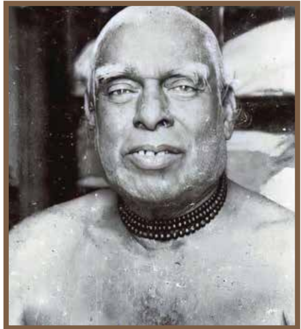
The last known photo of Srila Bhaktivinode Thakur