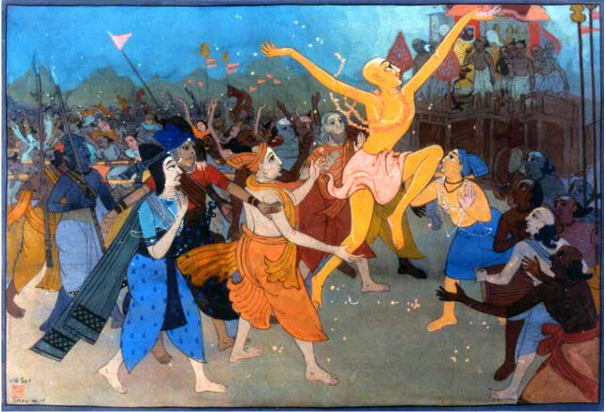
Sri Chaitanya Mahaprabhu dances at Ratha-yātrā

jaya jaya dhvani sura nara-maṇi gagane ūthaye rola