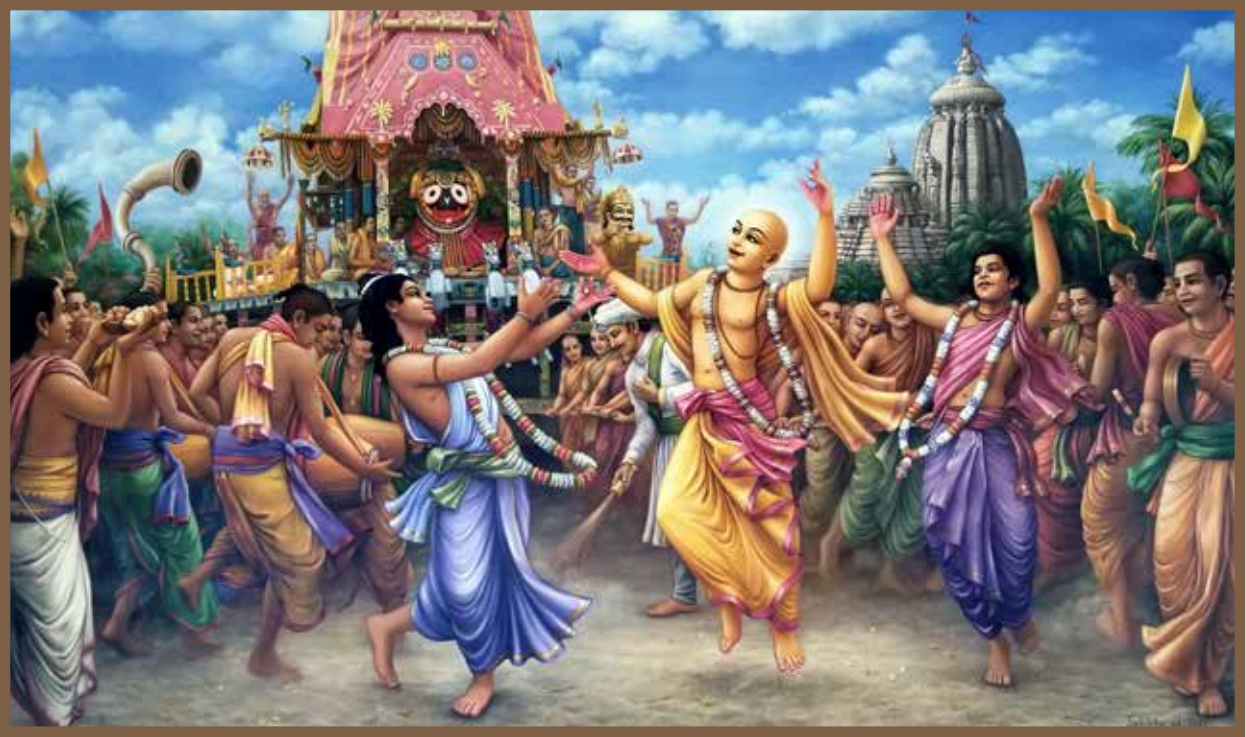
Sri Chaitanya Mahaprabhu dancing at Ratha-yātrā