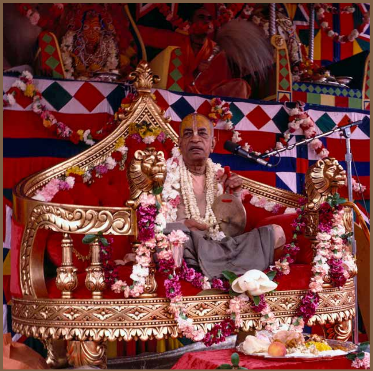
Srila Prabhupada at Ratha-yātrā in San Francisco

of Vrindavan. Although Krishna neglected the inhabitants of Vrindavan, he could not forget them. Thus, in his opulent Ratha-yātrā , he was returning to Vrindavan. In the role of Srimati Radharani, Sri Chaitanya Mahaprabhu was examining whether the Lord still remembered the inhabitants of Vrindavan. When Chaitanya Mahaprabhu fell behind the ratha , Jagannath Dev, Krishna himself, understood the mind of Srimati Radharani. Therefore, Jagannath sometimes fell behind the dancing Sri Chaitanya Mahaprabhu to indicate to Srimati Radharani that he had not forgotten. Thus, Lord Jagannath would stop the forward march of the ratha and wait at a