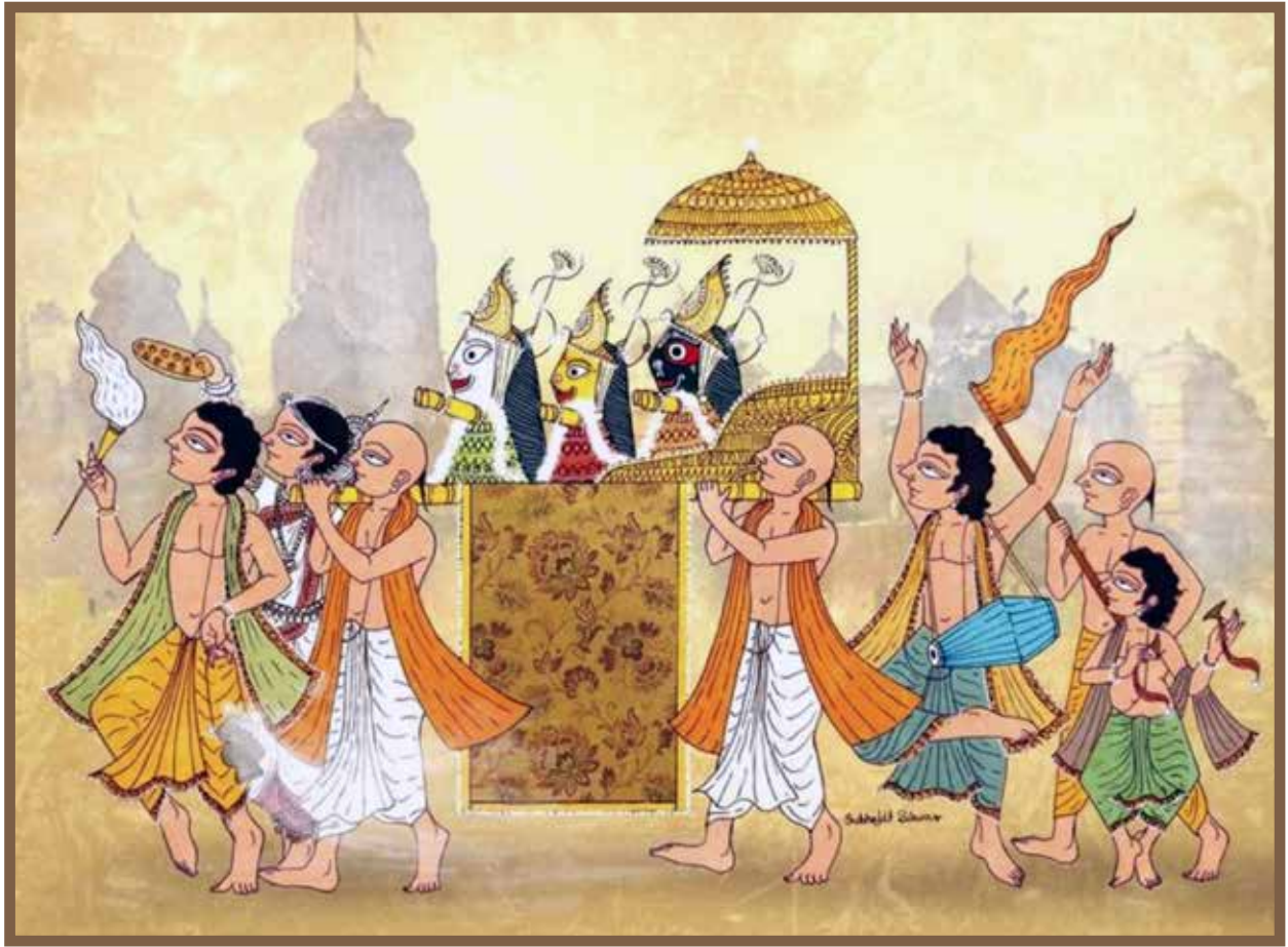
Painting by Subajit Biswas.