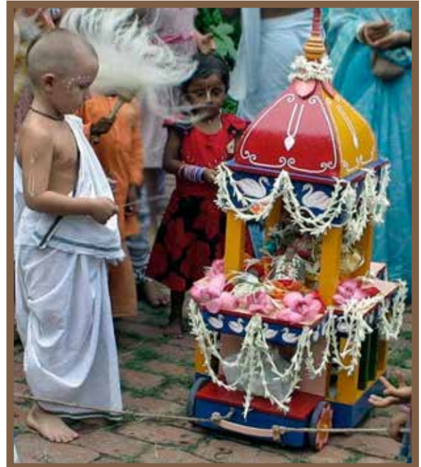
Children's Ratha-yātrā at ISKCON Mayapur